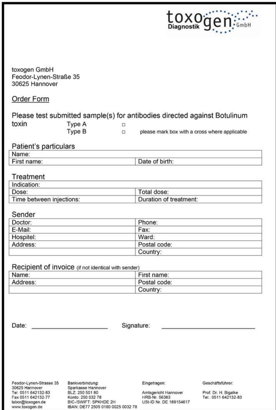
Figure 2. Resistance test form.