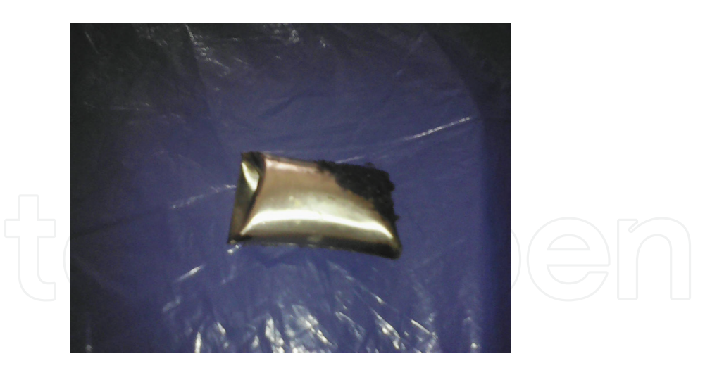
Figure 2. The mobile phone battery modified by the heat.

According to another study on people's opinion about children using a telephone, as the issue is raised by the question, "Should kids use smartphones?" 60% say "yes" [17].