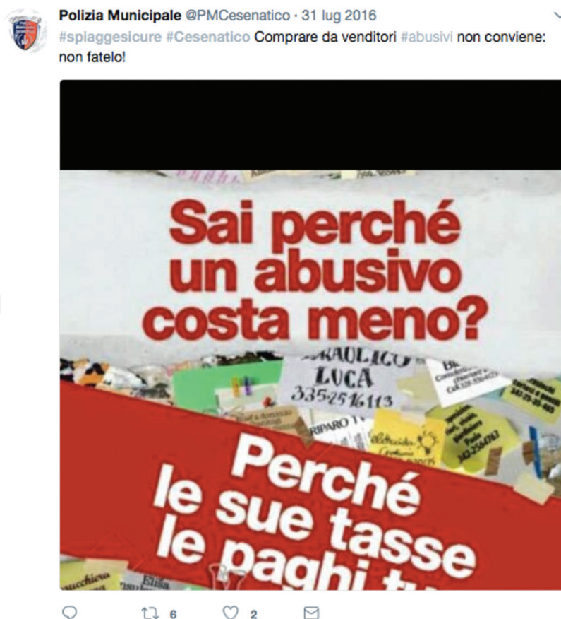
Figure 2. Screenshot from Twitter. Public user.

Only a few other tweets talking about the water conditions have been detected. They are mainly referred to Italy using the same ironic tone for describing the bad quality of the sea or the general scarce cleaning of places.