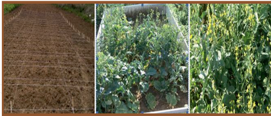
Figure 2. Different views from experiment fields (original).