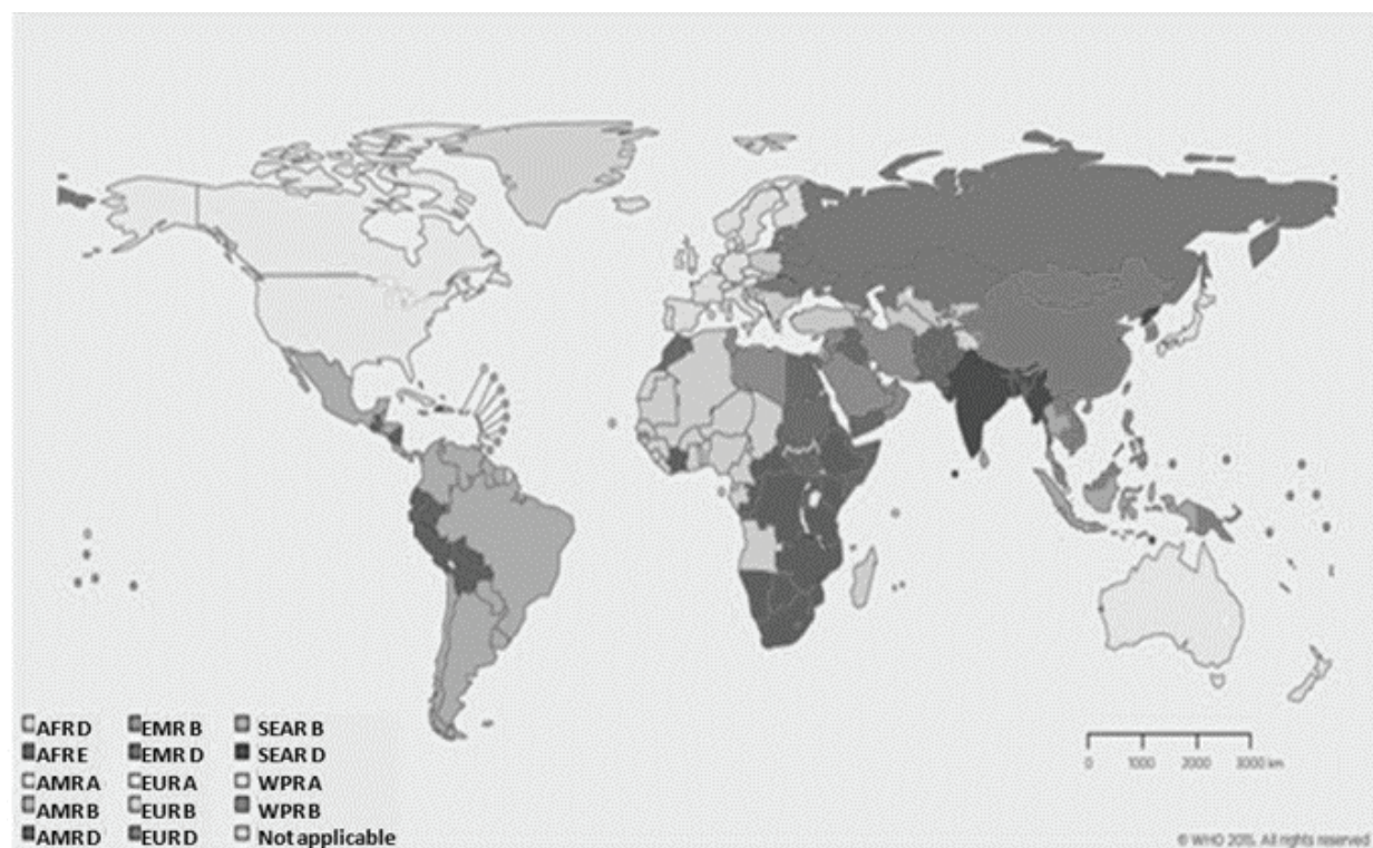
Figure 1. Geographical distribution of countries by region. Subregions are defined on the basis of infant and adult mortality. Stratum/Layer A = very low infant and adult mortality; stratum B = low infant mortality and very low adult mortality; stratum C = low infant mortality and high adult mortality; stratum D = high infant and adult mortality; and stratum E = high infant mortality and very high adult mortality. AFR: African subregion, AMR: American subregion, EMR: Eastern Mediterranean, EUR: European subregion, SEAR: South-East Asian subregions, WPR: Western Pacific subregion. Adapted from World Health Organization [26].

The risk group causing FBDs depends on the region, in developing countries such as African regions, South America, and South Asia, pathogens causing diarrheal diseases and the invasive pathogens causing infectious diseases and bacteria are the group that causes FBDs, followed by some cestodes and helminths; nevertheless, African regions, cestodes, and helminths are the group that causes FBDs because health and economic conditions limit proper food handling and preservation [17, 26].