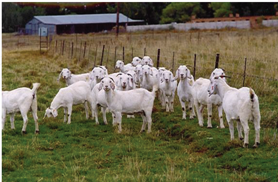
Figure 4. A herd of Savanna goats with primarily white coat color (University of Pretoria).

The indigenous veld-type goats have been subjected to limited selection and are largely unimproved genotypes. They have however contributed to the development of the local meat-type goats such as the Boer goat [4] through crossbreeding. The indigenous types vary in size and