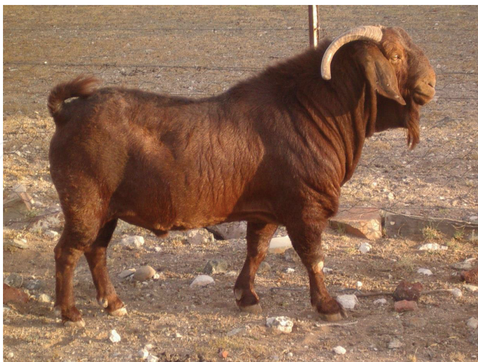
Figure 3. A Kalahari Red goat with the characteristic uniform red coat color (University of Pretoria).