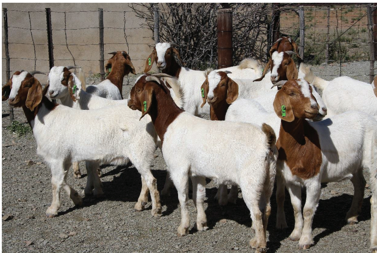
Figure 2. Typical South African Boer goats with white body and red head and neck (University of Pretoria).