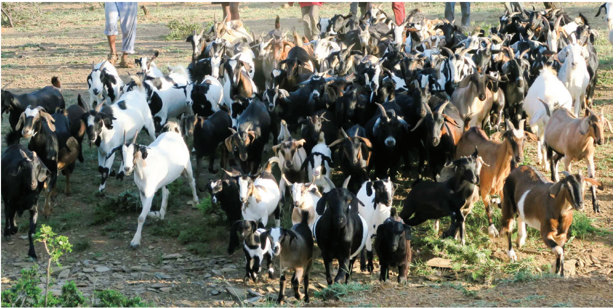
Figure 5. A herd of South African unimproved veld goats (Rauri Alcock).

are often promoted as having special adaptive characteristics, including a higher tolerance for tick-borne diseases compared to the commercial goat breeds [8, 10]. In Figure 5 , a typical South African veld goat is shown.