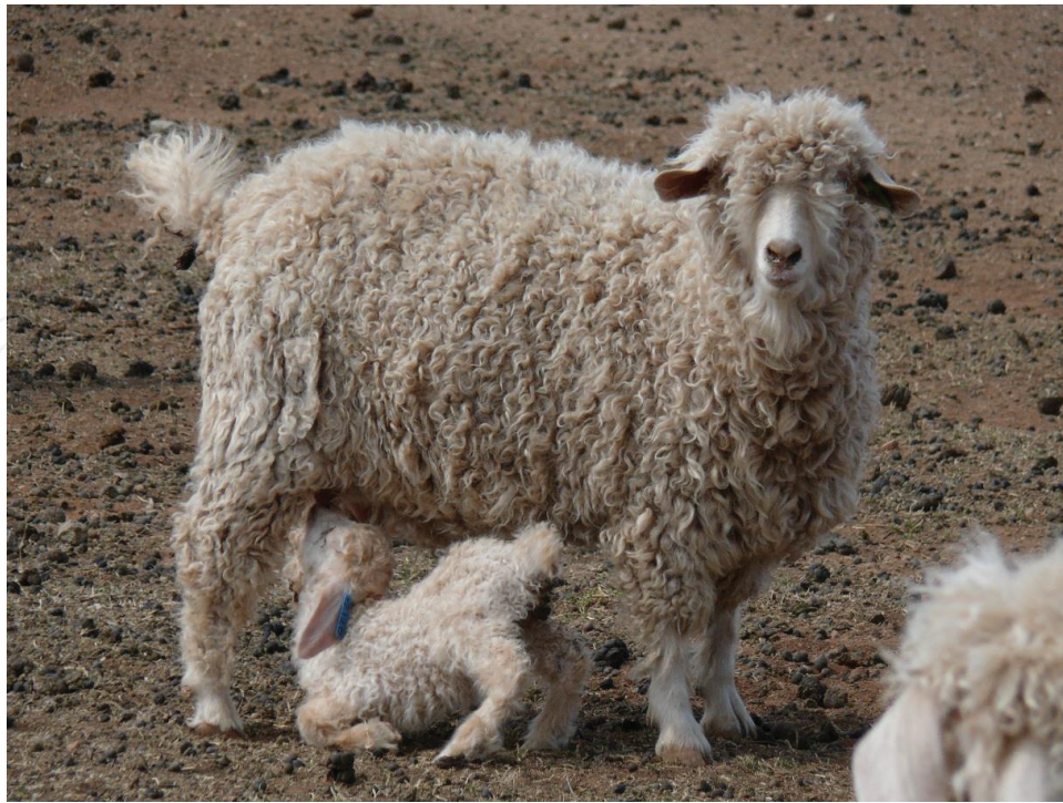
Figure 1. A typical South African Angora doe and kid (University of Pretoria).