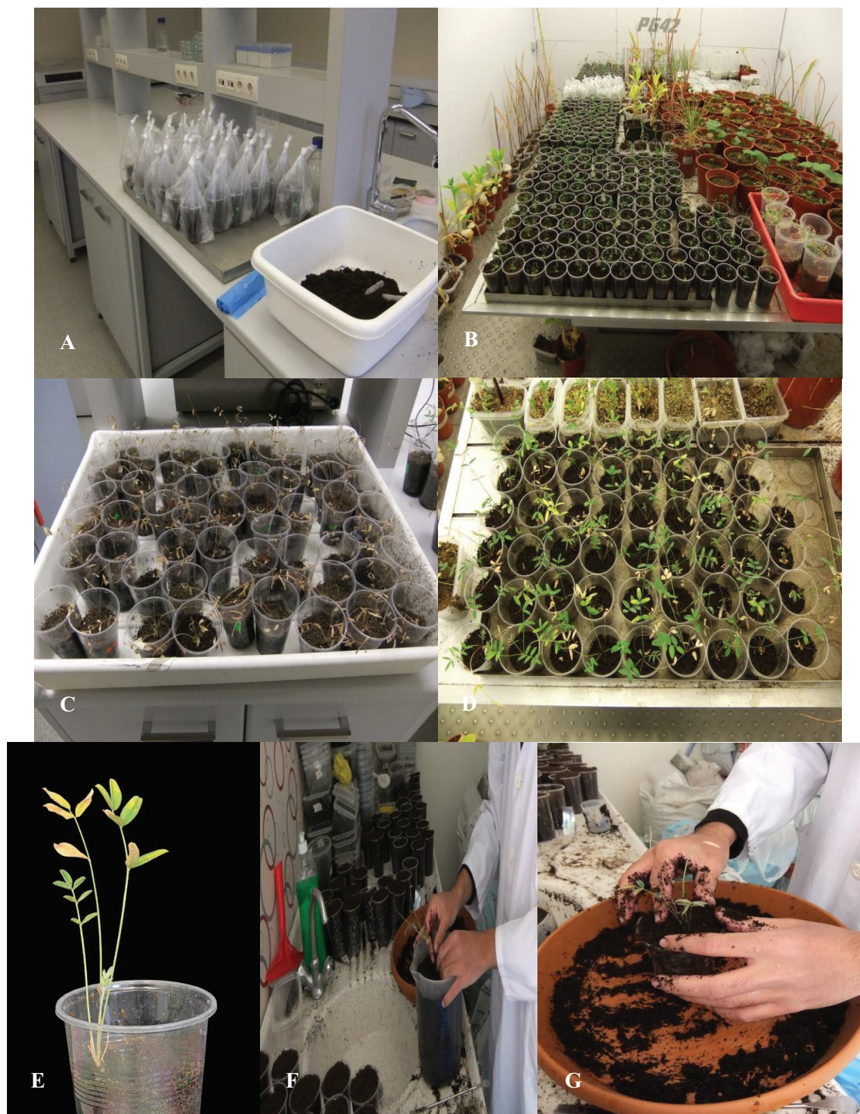
Figure 2. General view of plantlets in freezer bags (A). Plantlets which removed freezer bags in plant growth chamber (B). Dead plants as a result of salt application (C). Survived plantlets (D). Survived plantlets after treatments of NaCl (E). Washing root of survived plants with tap water to get rid of NaCl and transferred to new soil without NaCl (F and G).