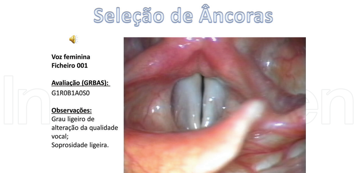
Figure 2. GRBAS PowerPoint prototype presentation using samples from JSLP [39].