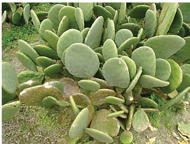
Figure 2. Morphological aspect of Redonda cultivar.