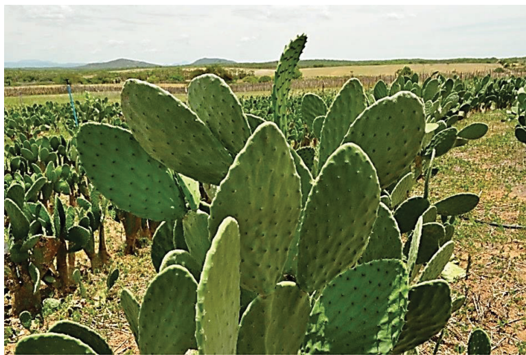
Figure 1. Morphological aspect of Gigante cultivar.

The Redonda cultivar ( Opuntia sp.), originated of Gigante cultivar, has medium size and stem many branched laterally, thereby reducing the vertical growth. Its cladode weighs about 1.8 kg, owning nearly 40 cm long, round and ovoid form. It presents great yields of a material more tender and palatable than the Gigante cultivar. Its lateral growth hinders the intercropping with annual crops, and thus, has been less common the planting with this cultivar [14–16] ( Figure 2 ).