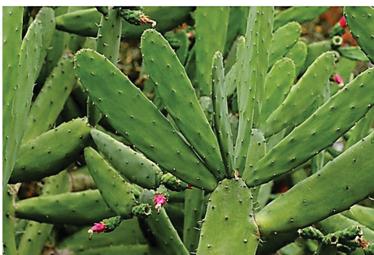
Figure 3. Morphological aspect of Miúda cultivar.

Regarding productivity [12], the Miúda cultivar has shown to be smaller than the Gigante and Redonda cultivars; however, when this production is considered in terms of dry matter, the results are equivalent, since the cultivar Miúda has higher dry matter content than the cultivars of genus Opuntia . Although it is considered as an excellent energy source (rich in non-fibrous carbohydrate, important source of energy and TDN) [2], the spineless cactus presents insufficient levels of neutral detergent fiber and crude protein for proper animal performance when provided as bulky food alone; therefore, the association with bulky foods of highly