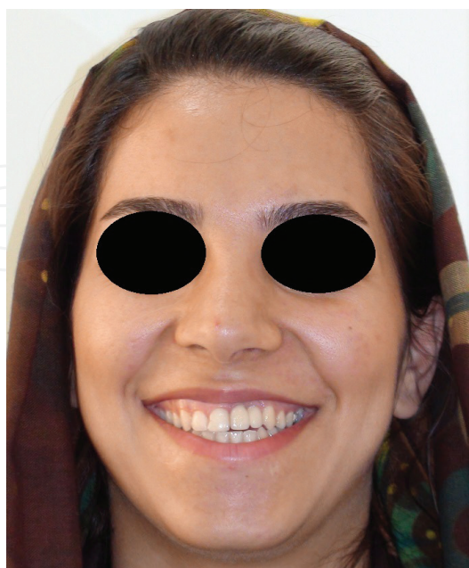
Figure 6. Frontal view of the patient after 5 years.