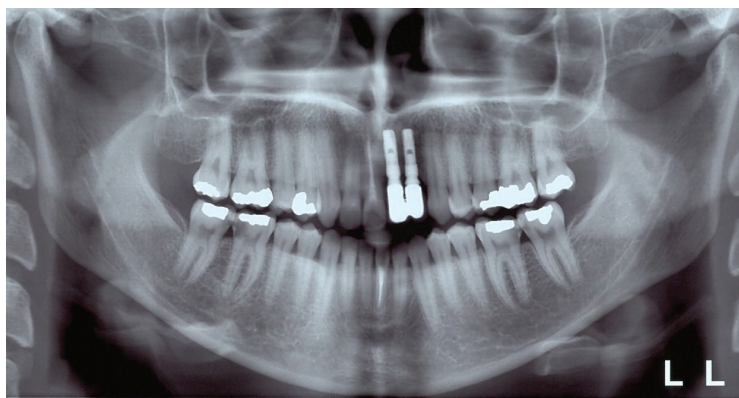
Figure 5. OPG of the same patient after 5 years.