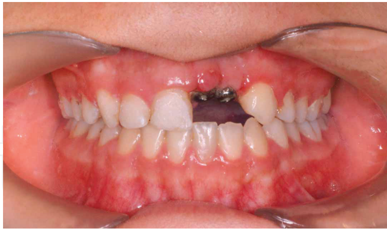
Figure 1. A patient immediately after implant abutment insertion.