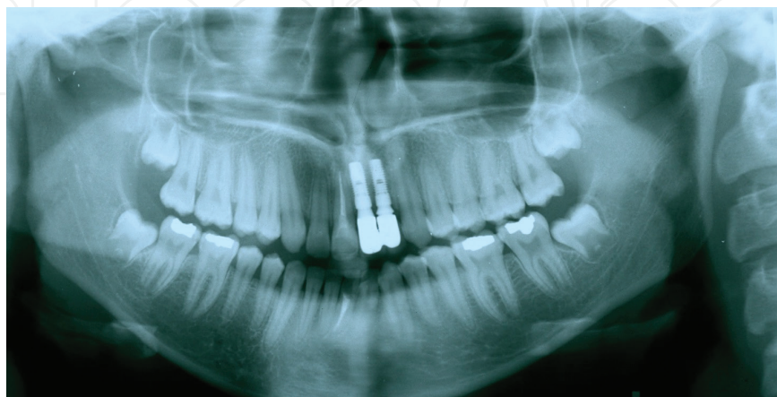
Figure 3. OPG (Orthopantomogram) of the same patient.