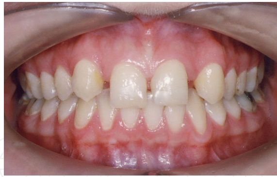
Figure 7. A patient with missing maxillary lateral incisors.