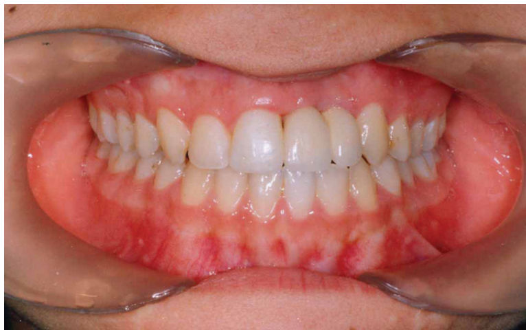
Figure 2. A patient immediately after implant insertion.