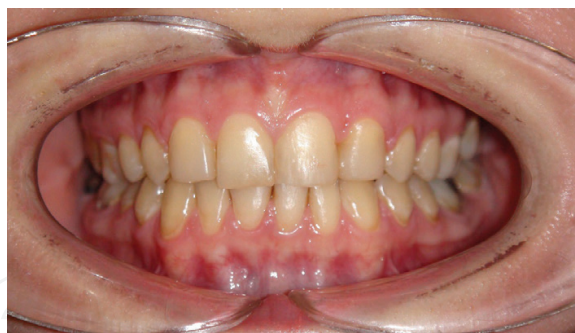
Figure 9. Same patient 5 years after orthodontic space closure.