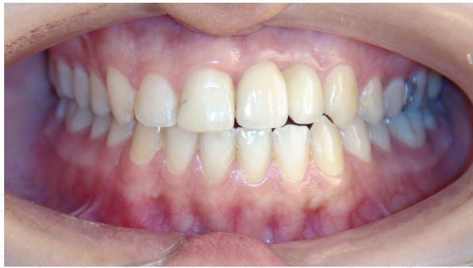
Figure 4. Same patient after 5 years.