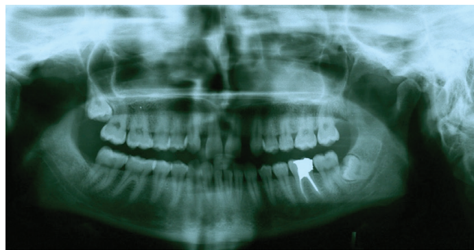
Figure 8. OPG of the patient with missing maxillary incisors.