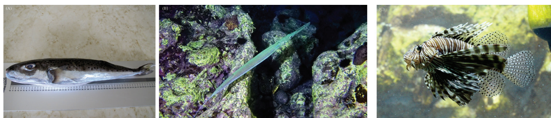
Figure 4. (A) Lagocephalus sceleratus, (B) Fistularia commersonii, (C) Pterois volitans.

Description: The body is elongated (20–85 cm), somewhat compressed laterally and inflatable. The body is brownish in colour with black, regularly distributed spots of equal size dorsally; a conspicuous wide silver band is present on the lower parts of the flanks, from the mouth to the caudal fin. The head is large with a blunt snout.