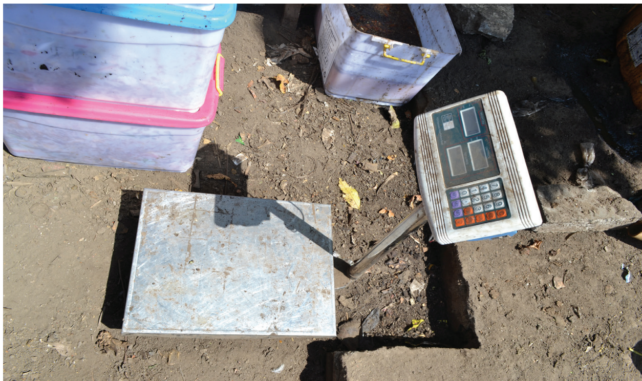
Figure 3. Weighing the waste in Bintang Sejahtera WB.

larger as a member of WB when it is needed. Bintang Sejahtera WB has cooperation with the environmental community initiative to collect waste from beaches and with the local government to provide collection system to transport the waste. It also offers seminars and trainings for local people in terms of waste treatment (composting and reuse-reduce-recycle method).