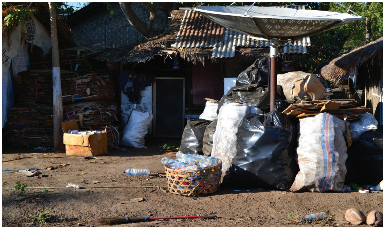
Figure 2. Condition of Bintang Sejahtera WB.