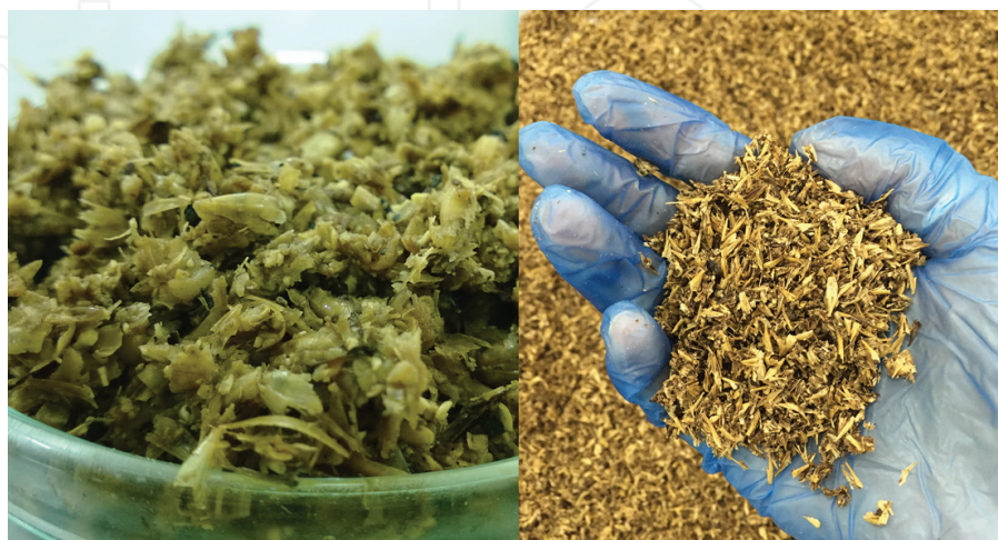
Figure 2. Fresh (left) and dried (right) BSG.

The lack of solubility of BSG proteins presents a barrier for their more extensive use in food processes and products. Protein hydrolysates from agricultural crops have already demonstrated bioactive effects which support their potential use as functional food ingredients. In addition, these products can have numerous properties indispensable for the food industry such as emulsifying agents, film forming properties, flavour binding, viscosity increase by