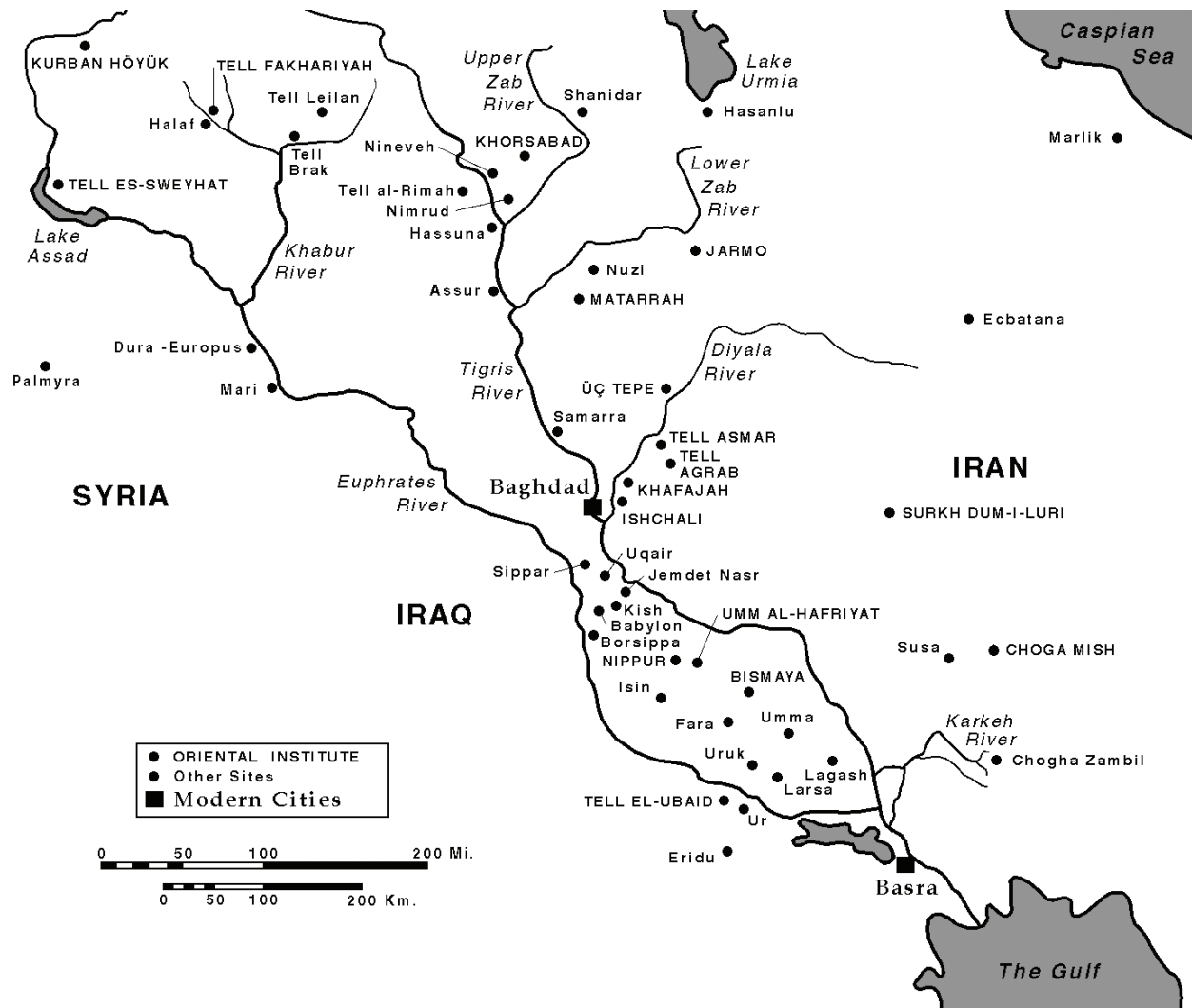
Figure 1. Mesopotamian territory and its main cities, courtesy of the Oriental Institute of Chicago.

and the Persian Gulf in the south allowed a myriad of contacts, direct and indirect, with Anatolia, the Iranian plateau, the Oriental Mediterranean Coast, Egypt, Oriental Africa and even the Indian Ocean.