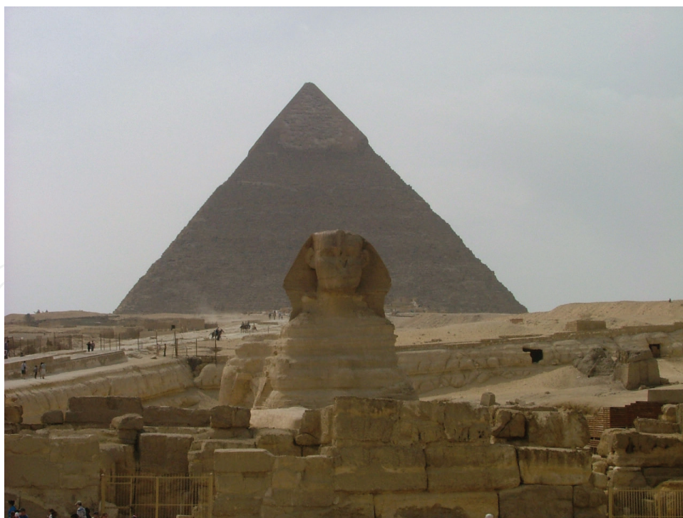
Figure 4. Khafre Pyramid and the Sphinx, picture by the author Helena Trindade Lopes.

However, it was during the following dynasty, circa 2560–2540 BC, that the pyramidal shape achieved perfection with the construction of the Giza complex [41]. The three extraordinary pyramids of Khufu, Khafre and Menkaure still defy human comprehension, claiming their eternal seat, both in time and in space, just like it was intended by their constructors ( Figure 4 ).