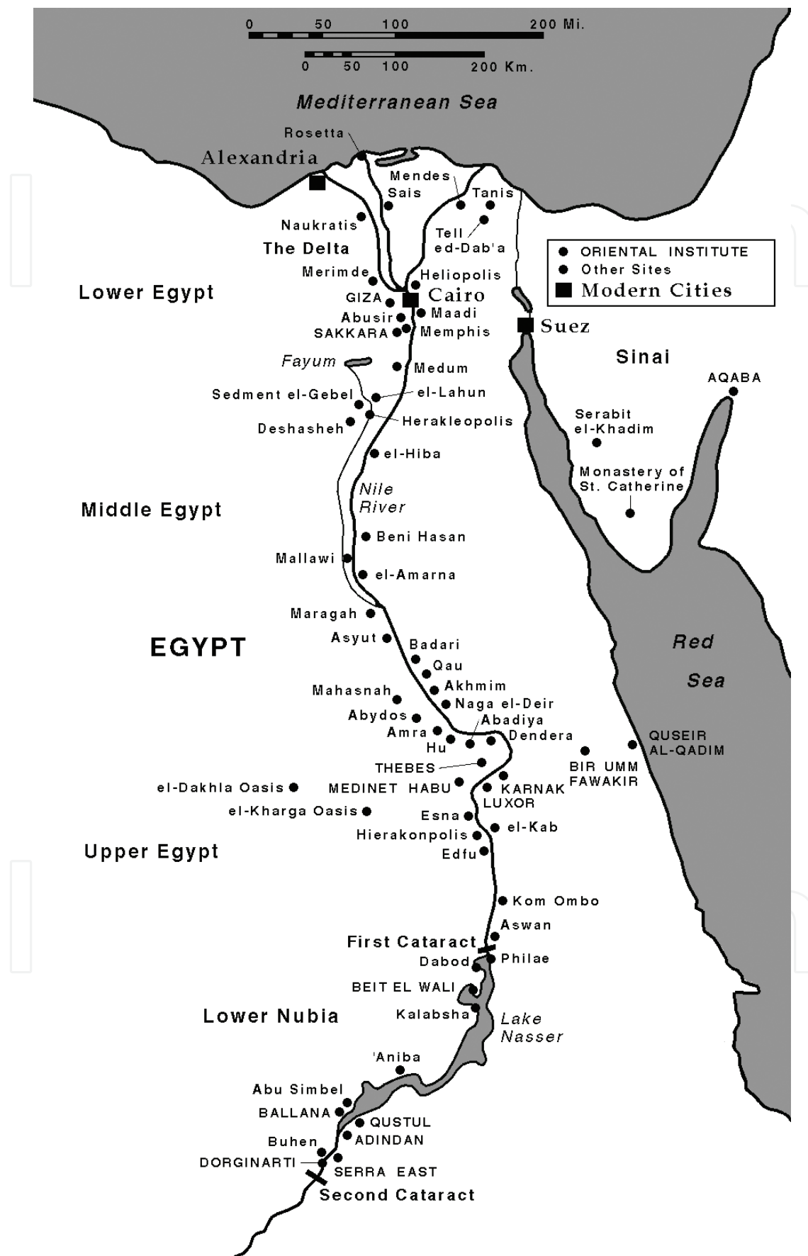
Figure 2. Egyptian territory and its the main cities, courtesy of the Oriental Institute of Chicago.