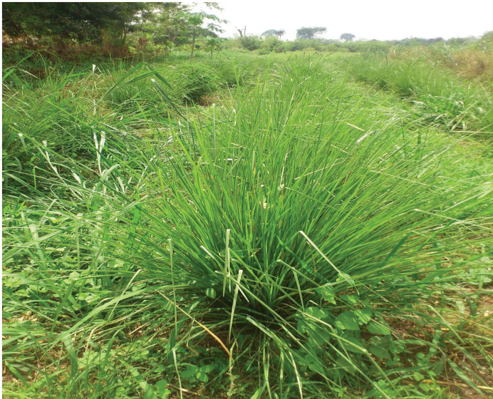
Figure 1. Vetiver ( Vetiveria zizanioides L.) grass strips at the University of Ibadan, Nigeria.