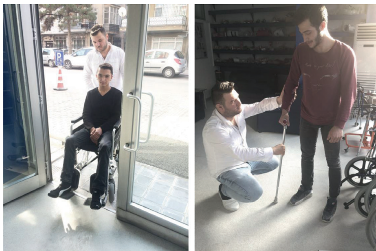
Picture 3. Client's needs for mobility.