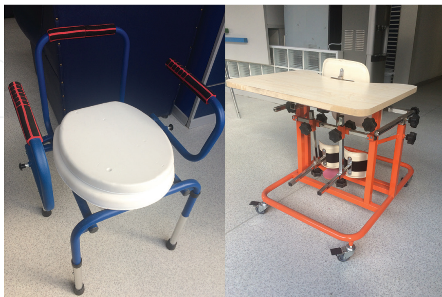
Picture 1. Assistive technology for daily living activities.

A person can have different roles simultaneously, and the roles we hold during our lifetime can change such as being a student, parents, a son, a sibling, an employee, a friend, and a