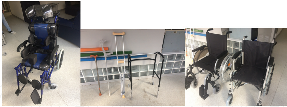
Picture 2. Mobility device for participation of people with disabilities.