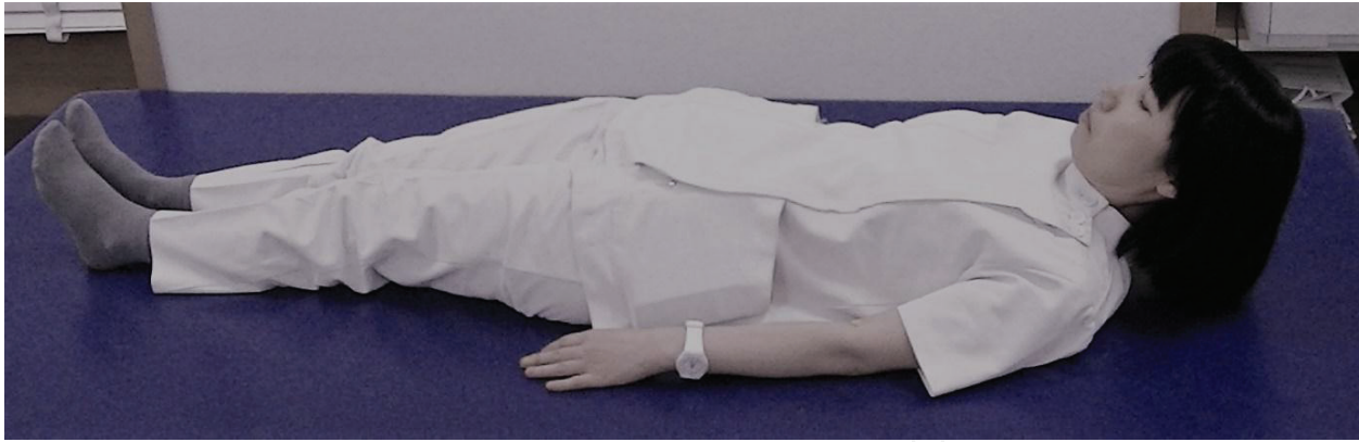
Figure 3. Shaker exercise. Lying on a bed and raising the head without lifting the shoulder, while looking at the toes.