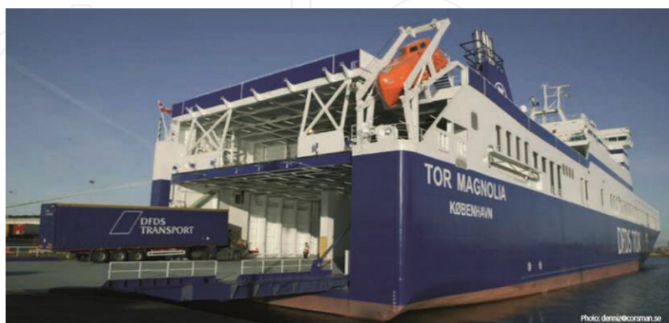
Figure 5. Loading a RO-RO ship.

Much of the long-distance refrigerated transport by truck is done using such trucks pulling refrigerated semi-trailers (reefers) only onto the vessel, the decoupling from the trailer. The number of trailers involved into the transportation process is estimated to be 100 semi-trailers due to skip capacity. Return cargo is a crucial and still unsolved economic factor. The project