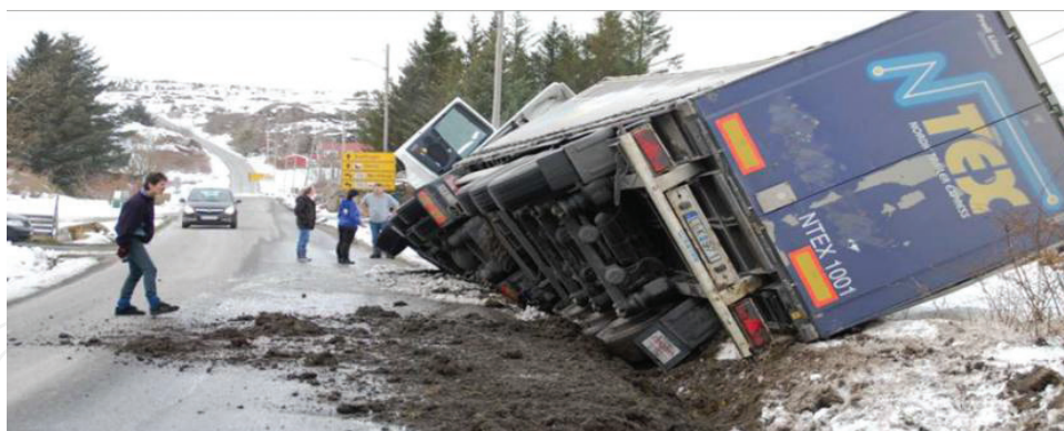
Figure 2. Seafood on Norwegian roads is prone to frequent accidents.

values promoted to their own export market customers such as retailers that they may tend to prefer sea transport solutions. This, however, may also demand traceability to verify the use of transport modes. Such choices may accordingly benefit the reputation of the firms from corporate social responsibility standpoint.