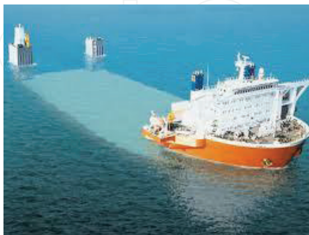
Figure 4. A FLO-FLO ship operation.

The RO-RO technology is used for the fresh fish transportation in the studied case. Roll-on-Roll-off is the technology, which is applied in the design of ships and allows to carry wheeled cargo. This is the only one solution for sea transportation of heavy-wheeled freight such as trucks and other bulky construction and road machinery. According to Medda and Trujillo [17], the RO-RO vessels need considerable investment that implies the requirements for a satisfactory level of the commercial operations. The RO-RO vessels have built-in or shore-based ramps that allow the cargo to be efficiently driven on and off the ship during loading/