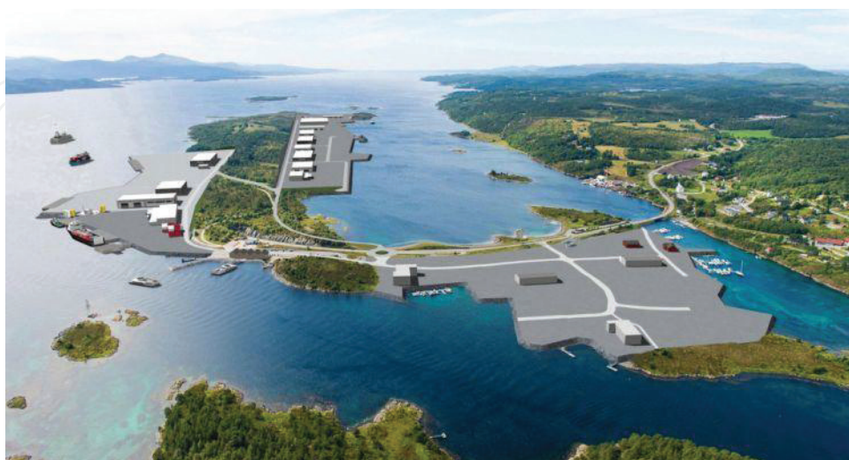
Figure 1. The projected industrial park and harbour facility at Hitra.

This means that a change of road to SSS transport involves convincing the seafood producers' foreign customers. Most of these importers are located in the EU and currently have their goods transported door-to-door by trucks. This is clearly, except for the frequent accidents on wintery Norwegians roads (see Figure 2 ), a convenient transport solution. Furthermore, the seafood producers and exporters are fundamentally indifferent to how their goods get transported, by which trucking company, it is only when they take into consideration societal