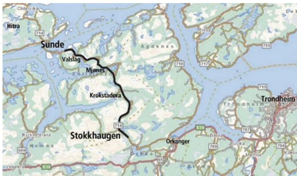
Figure 6. The “salmon road”.

The official opening of Hitra Port took place on 16 October 2014. Regular container ship calls started in November 2014. After 5 years, the main elements of the infrastructure are on the place. The infrastructure of the port includes production and social components as engineer