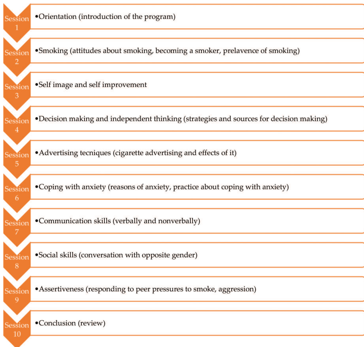
Figure 2. School-based life skills education sessions about prevention of cigarette smoking [39].

sport participation which provides psychosocial development may contribute to life skills in children and adolescents [41]. Although there is not enough research focusing the effect of sports on life skills development, there is growing interest about the development of life skills through sport in children and adolescents and sport psychology. Many athletes have begun to understand the importance of using sport psychology strategies and techniques to improve their nonathletic life. One study which is about teaching life skills through sport, mentioned a program which calls Sports United to Promote Education and Recreation (SUPER). The objective of the program was to show participants the importance of physical and mental skills for sport and life and the existence of the effective student-athlete role models. In this program, topics such as similarities and differences of life skills and sport, being a good listener, speaking with the group were taught to the participants who are sport leaders. And these leaders taught students sport skills and life skills related with sport, coached the students to increase their sport performance [42]. Sport-based life skill education is also important on