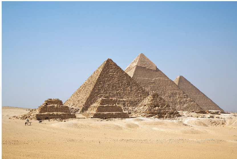
Figure 1. Solutions for parasitic problems as old as the Egyptian pyramids.

malaria. Before we proceed, it is worth to mention that many of the pharaoh's written orders that urged farmers to combat pests and protect the environment from pollution. Consequently, Egypt was one of the first countries that paid special attention to environmental problems and its impact on the individual who is considered the most important wealth. The Egyptians did not like pests which plagued them but accepted them as a legitimate part of creation;