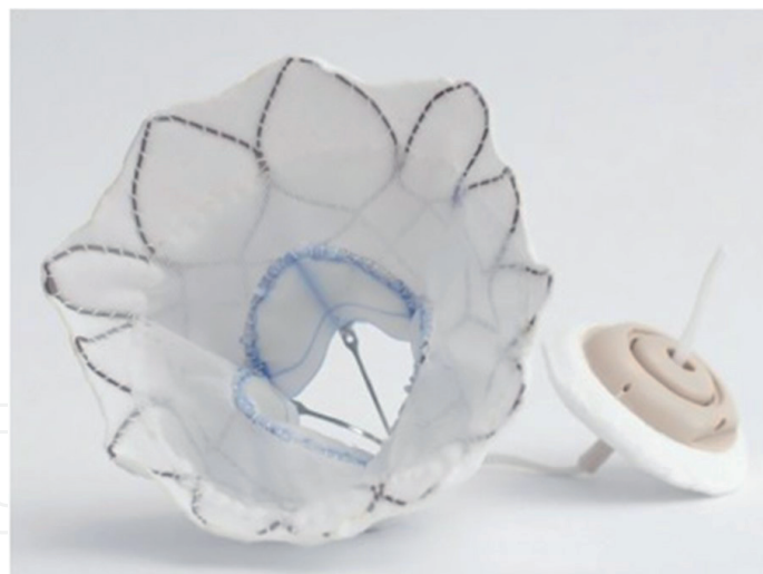
Figure 2. Tendyne (Abbott Vascular, Santa Clara, CA) is a transapically delivered porcine pericardial valve for transcatheter mitral valve replacement.

Despite continuing innovation, current transcatheter mitral valve replacement delivery systems remain large and the majority require a transapical retrograde approach to the mitral valve. Therefore, the collaboration between interventional cardiologists and surgeons is needed as with the transapical TAVR procedure.