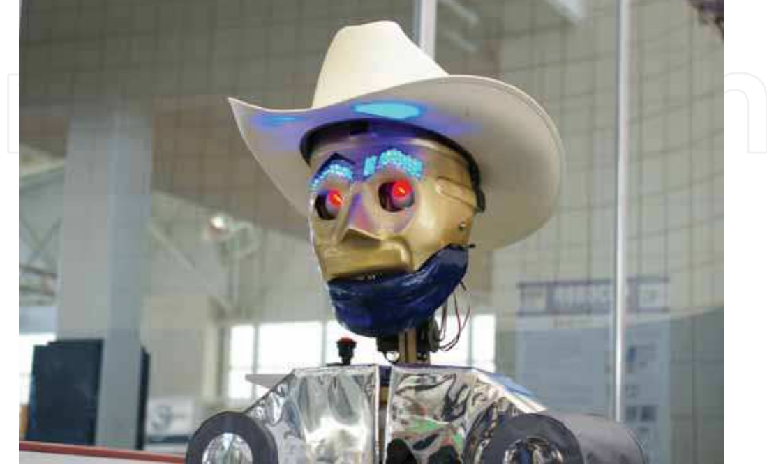
Figure 1. The @Home robot from the Pumas team (Mexico), lead by Jesus Savage, trying to convey some emotions. The first steps towards sociable robots?