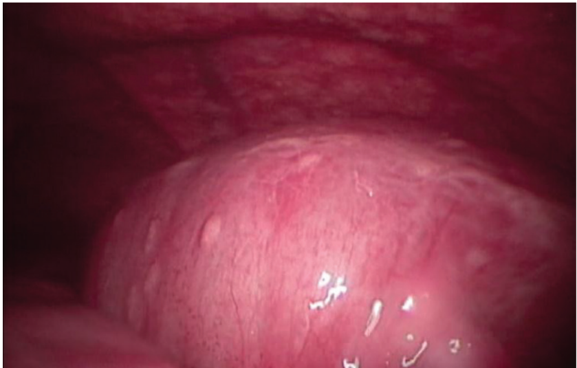
Figure 1. Miliary tubercles on the intestinal wall and abdominal wall.