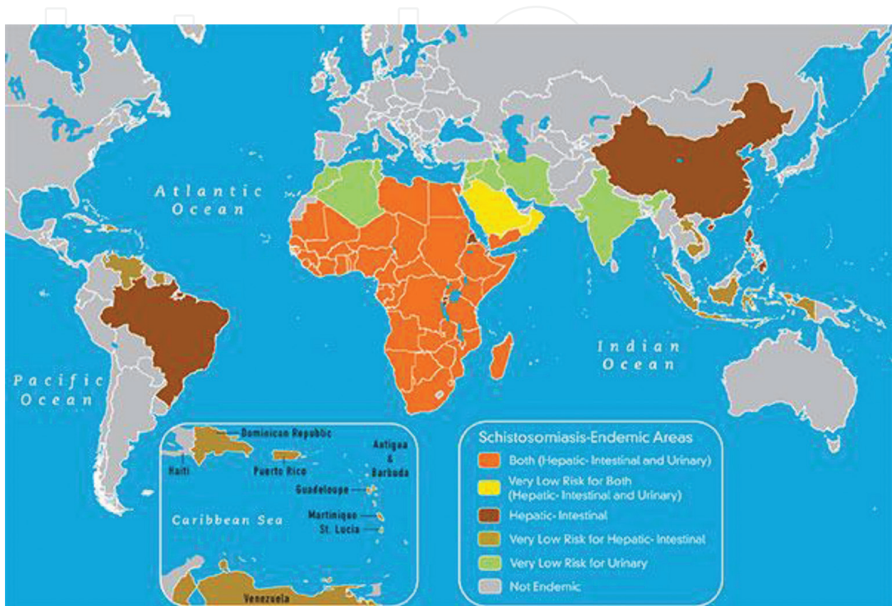
Figure 1. Map of the current global distribution of schistosomiasis.