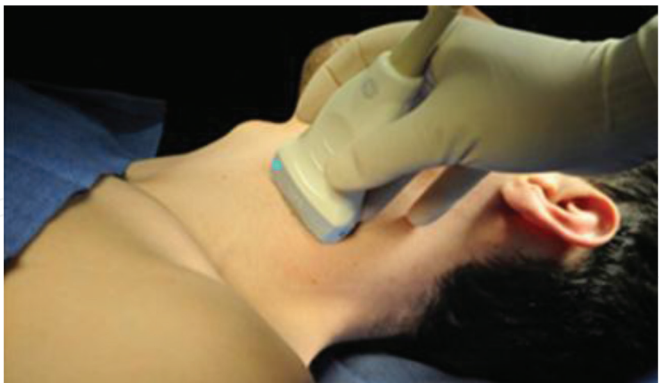
Figure 1. Placement of ultrasound transducer for ultrasound-guided left stellate ganglion block.