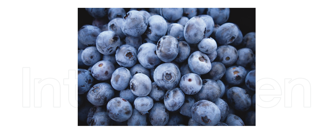
Figure 7. Fruits of Vaccinium corymbosum commonly name highbush blueberry.

Plasma antioxidant capacity (PAC) is considered a biomarker for antioxidant status of humans. In this context, Fernández-Panchon et al. [129] indicated that PAC increased following consumption of some foods rich in phenols, which could be related with in vivo bioactivity, and its consequent positive effects for human health. More specific biological properties of blueberry have been described, such as anticarcinogenic, antidiabetic, antiinflammatory, antimicrobial, and reducing cholesterol, among other activities [133–135]. The hypoglycemic activity of blueberry is mentioned by several authors. Aktan et al. [135] reported a severe case of hypoglycemia in a patient of 75 years old, who had diagnosed but untreated prediabetes. Just before the episode, this patient consumed about 500 mL juice of blueberry and Laurocerasus officinalis , which is also considered hypoglycemic. Similarly, Cheplick et al. [136] affirmed from in vitro studies that blueberry fruit has potential for diet-based management of hyperglycemia, especially in the early stages of disease.