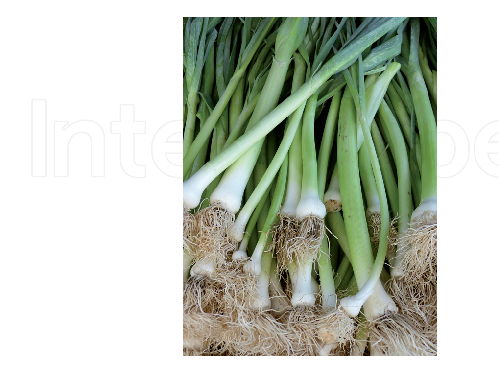
Figure 2. Green leaves and white part of leek.

It has been reported that this species has a substantial nutraceutical and functional properties (see Table 1 ) and is cultivated in Asia, America, and Europe, especially in the Mediterranean region [23, 24]. A. ampeloprasum , belongs to subgenus Allium section Allium ( Figure 2 ), is considered a "complex species" due to different ploidy levels and genome constitution, and diploid, tetraploid, and octoploid accessions have been described [25, 26]. In fact, Hirschegger et al. [27] suggested that molecular evidence could be used to consider this species as a tetraploid horticultural group together with other Allium genus species. This condition is particularly important in accounting for its nutritional, functional, and nutraceutical characteristics [28].