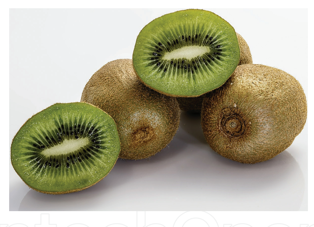
Figure 5. Fruits of Actinidia deliciosa commonly name kiwifruit.

strong antioxidant properties that contribute to protect cells against oxidative damage [62]. Its antioxidant capacity (ORAC) varies from 0.06 to 1.4 µmol TE 100 g<sup>-1</sup> FW of fruit, depending on the hydrophilic or lipophilic fraction used in the analysis [60]. Lee et al. [63], using the same method but expressed as vitamin C equivalents (VCE), reported values from 595.7 to 2662.7 VCE 100 g<sup>-1</sup> FW. Clinical studies indicate that the uptake of vitamin C derived from kiwifruit reaches 40% in humans, similar to the rate of synthetic vitamin C uptake [64, 65]. This was tested by Vissers et al. [66] in a mouse model, where they found highly effective delivery to tissues. Together with vitamin C uptake, several other nutrients and beneficial phytochemicals are consumed, with synergistic effects, among them, of iron (Fe). A clinical study with women [67, 68] indicated that a breakfast fortified with Fe, when consumed with kiwifruit, can improve Fe content in women with low Fe stores; this may be related with the high values of AA, lutein, and zeaxanthin of kiwifruit.