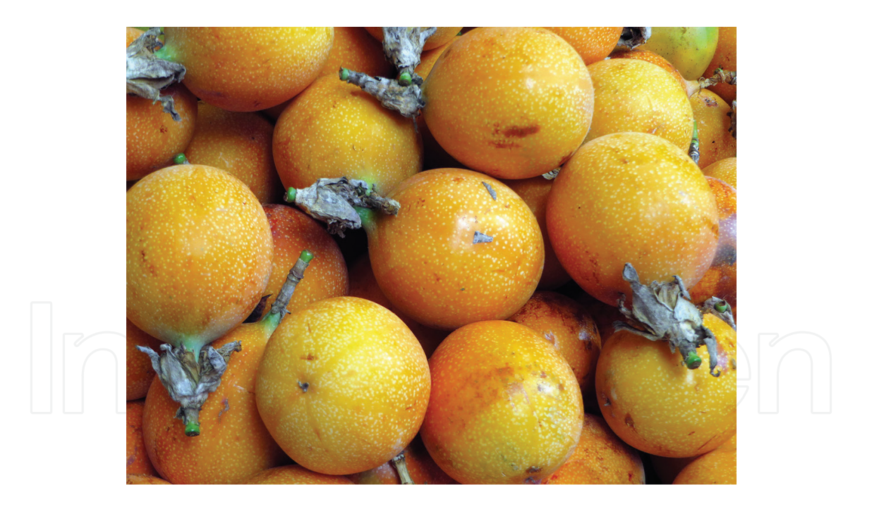
Figure 8. Fruits of Passiflora edulis commonly name maracuyá.