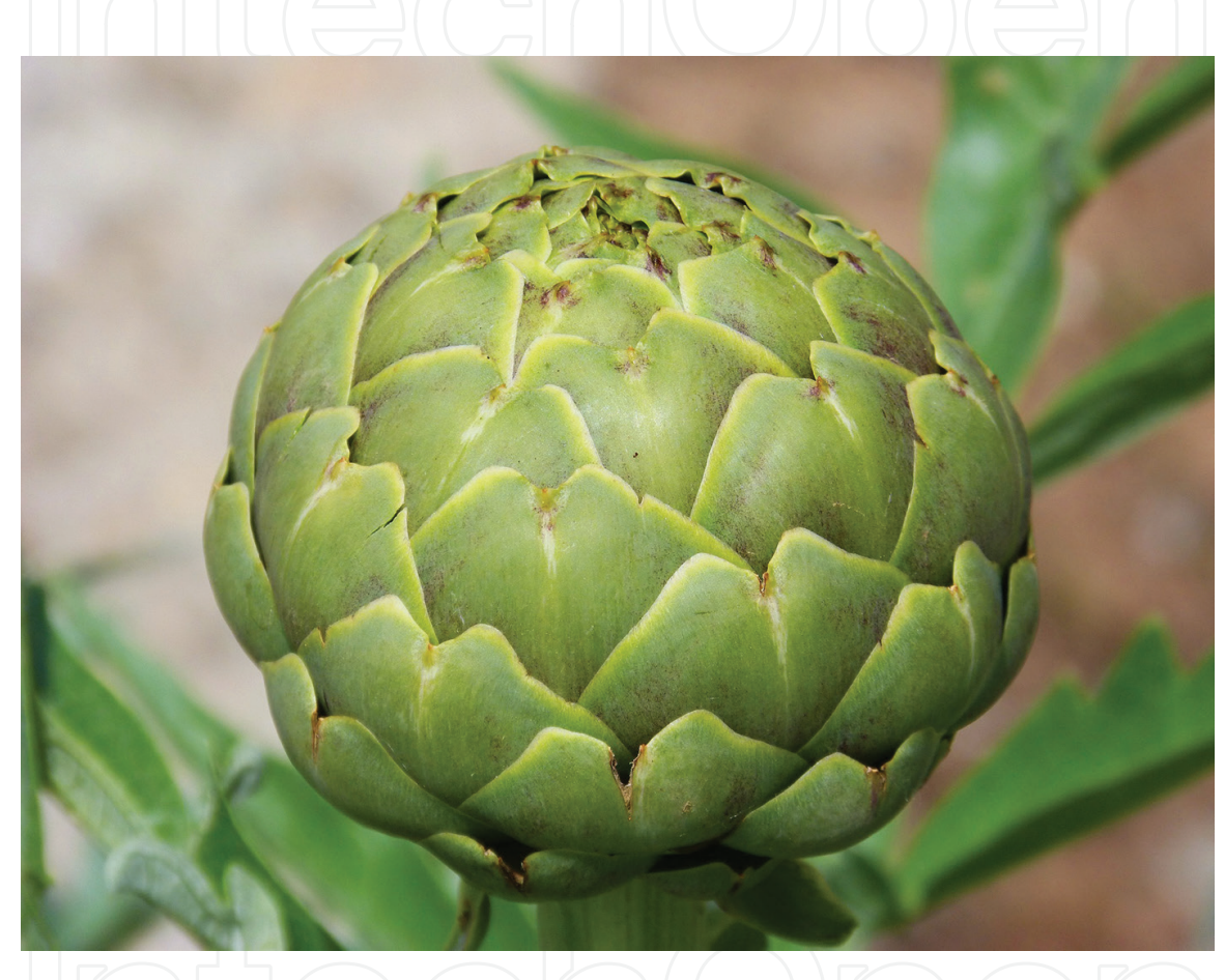
Figure 1. Immature flower head of artichoke.

high antioxidant capacity, with more than 9000 \mu mol trolox equivalents (TE) 100 g<sup>-1</sup> FW [12]. This antioxidant capacity is due to its high content of total polyphenols like caffeoylquinic acids and flavonoids [7]. These polyphenols are present in flower heads, with values ranging from 4.8 to 29.8 mg g<sup>-1</sup> FW in different Italian varieties [7, 13, 14]. It is important to mention that these values are not only dependent on the genetic background, as the interaction genotype-environment also has an influence [7]. Therefore, antioxidant content may be affected by agricultural practices, because in different locations, the same variety may have different antioxidant capacities.