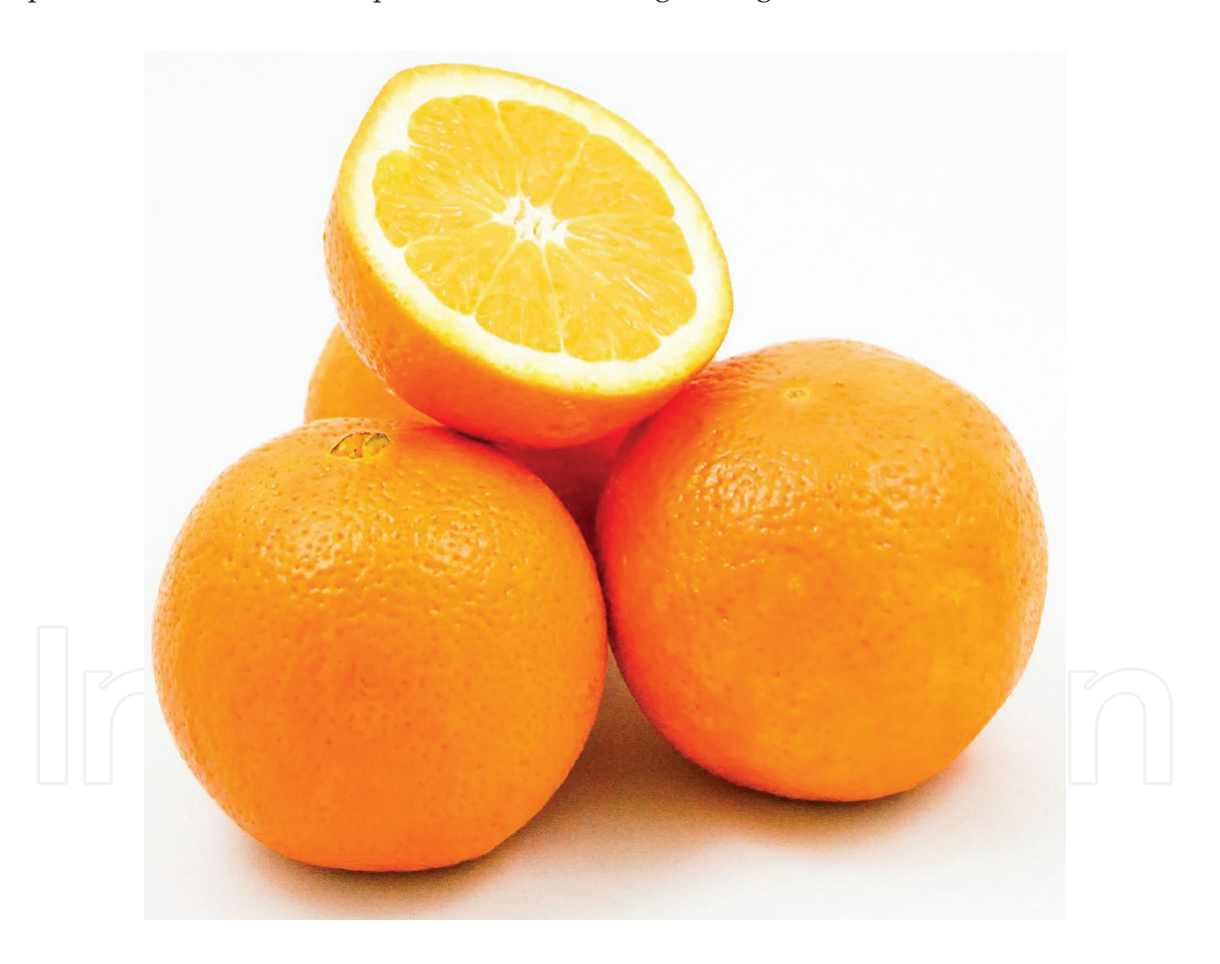
Figure 6. Fruits of Citrus sinensis commonly name sweet orange.

The sweet orange is one of most economically important fruits in worldwide [88, 89]. It is believed that the Citrus genus is native to Asia, specifically from Southern China (Yunnan), which may be the origin and point of distribution of several contemporaneous Citrus species [90]. Citrus sinensis (L.) Osbeck belongs to the Rutaceae family and is believed to be a backcross hybrid between pummelo and mandarin ( Figure 6 ) [91, 92]. The sweet orange species have several cultivated varieties, some of which are mentioned by Grosso et al. [93], but in this chapter we will discuss this species without distinguishing between varieties.