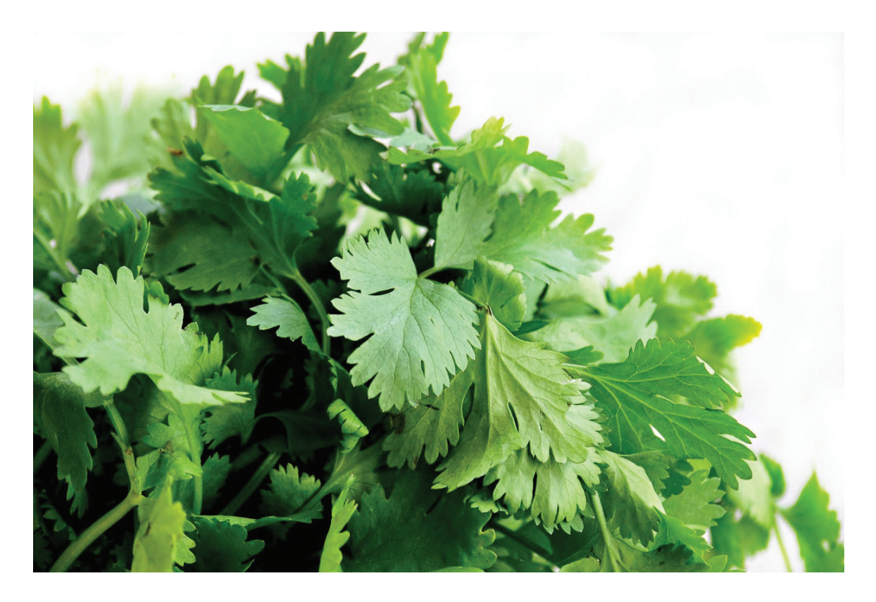
Figure 4. Stem and immature leaves of coriander.

This species of the Apiaceae family ( Figure 4 ) is usually cultivated throughout the year in diverse edafoclimatic areas [43]. It is native to Italy and is currently propagated in several Mediterranean regions of Europe, as well as in America and Asia [44]. It is consumed principally fresh, either alone or in salads. This species has multiple human health benefits and has considerable potential as a functional horticulture species (see Table 1 ). C. sativum contains essential oils in seeds and in the pericarp whose content and composition appear to be dependent on biological and geographical traits [35]. The oil content is approximately 1% of seed weight of which linalool is the major component (73%) [44–46]. In the stem and immature leaves, the most important compounds are essential oils, flavonoids (quercetin, kaempferol, and acacetin), phenolic acids (vanillic acid, p-coumaric acid, syringic acid, p-OH benzoic acid, cis-ferulic acid, and trans-ferulic acid), and polyphenols [8]. The principal phytochemicals are \beta -carotene (5.1 mg g<sup>-1</sup>DW), AA (1.16 mg 100 g<sup>-1</sup> FW), total phenolics (2.05 mg GAE 100 g<sup>-1</sup> DW), and antioxidants (1.12 mg GAE 100 g<sup>-1</sup> DW) [47].