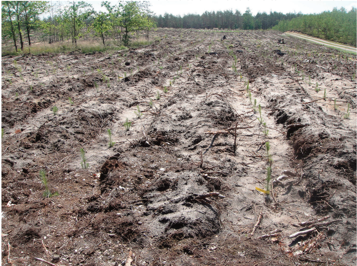
Photo 1. Typical Pinus sylvestris plantation in Poland.

Forests can be susceptible to insect attacks at all stages, and forest plantations newly established on clear-cuts left after harvesting of old stands facilitate the concentration of insects associated with specific stand ages ( Photo 1 ). In Poland, weevils (Coleoptera: Curculionidae) represent the most important group of pest insects of 1–5-year-old forest plantations established on clear-cuts [7–9]. The aim of this paper is to present the most important insect species damaging forest plantations and their management, including methods to estimate and reduce their numbers.