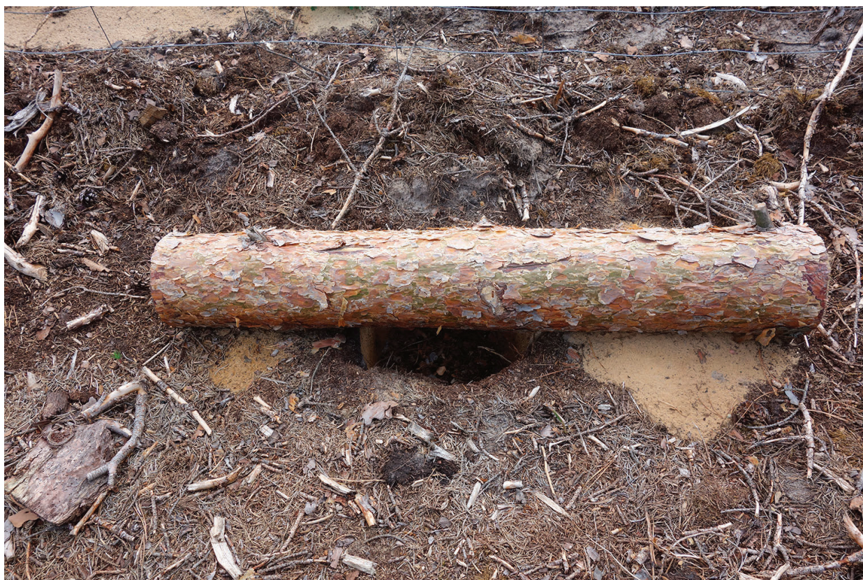
Photo 3. Pinus sylvestris billet used for protection of reforestations; under the trap there is a hole to collect Hylobius abietis beetles.

Evaluation of the number of P. castaneus and the level of damage to P. sylvestris plantations and thickets is performed on the basis of the number of trees colonized by the pest on areas of its occurrence in the previous years and in young forests weakened by biotic (fungi, insects, deer) and abiotic (drought, hail, fire) factors. The observations are performed every two to three weeks from mid-May to the end of September.