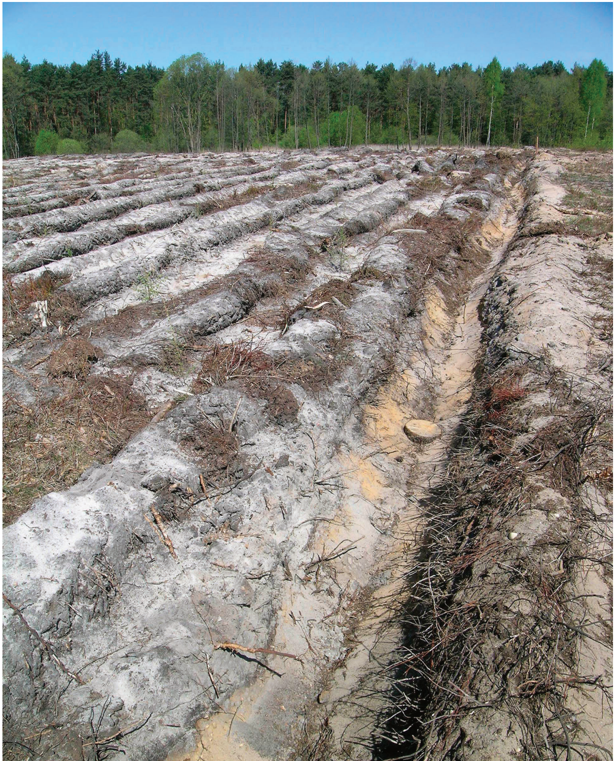
Photo 6. Plantation surrounded by groove with slice of pine wood to collect pest beetles.

captured nontarget insects belonged to the family Carabidae, which entered the traps accidentally or on the search for shelter. Beetles from the families Dermestidae, Geotrupidae, and Silphidae that feed on dead insects were probably attracted by the smell of decomposing insects inside the traps. Removal of stumps from the clear-cuts can reduce populations of