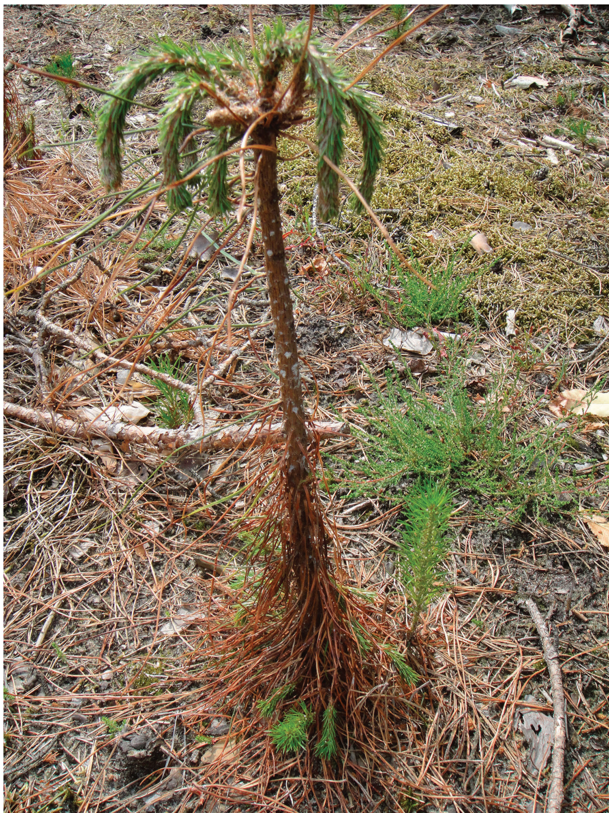
Photo 2. Pinus sylvestris seedling with the characteristic symptoms of the colonization by Pissodes castaneus : leaks of resin on a stem, hanging top shoots.