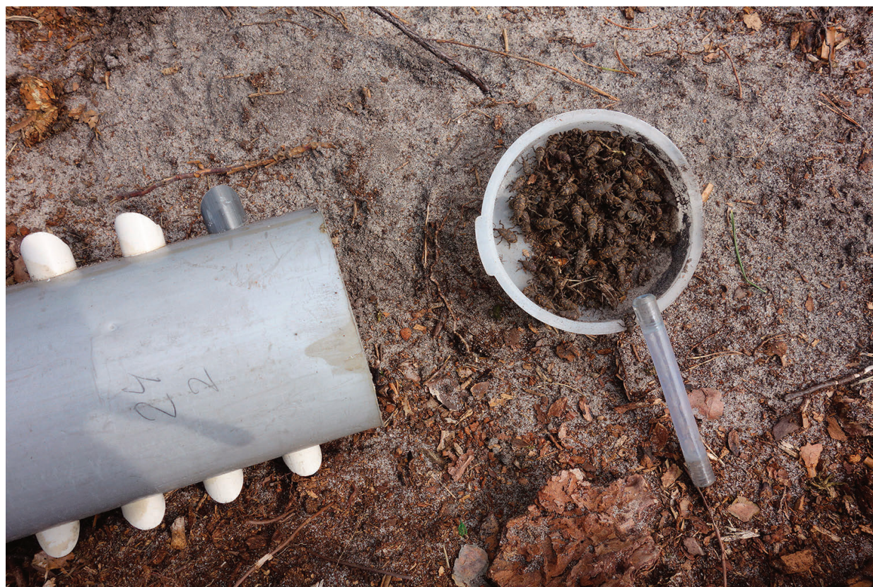
Photo 5. Hylobius abietis beetles collected by IBL-4 trap, visible dispenser in the form of tube filled with synthetic attractant.