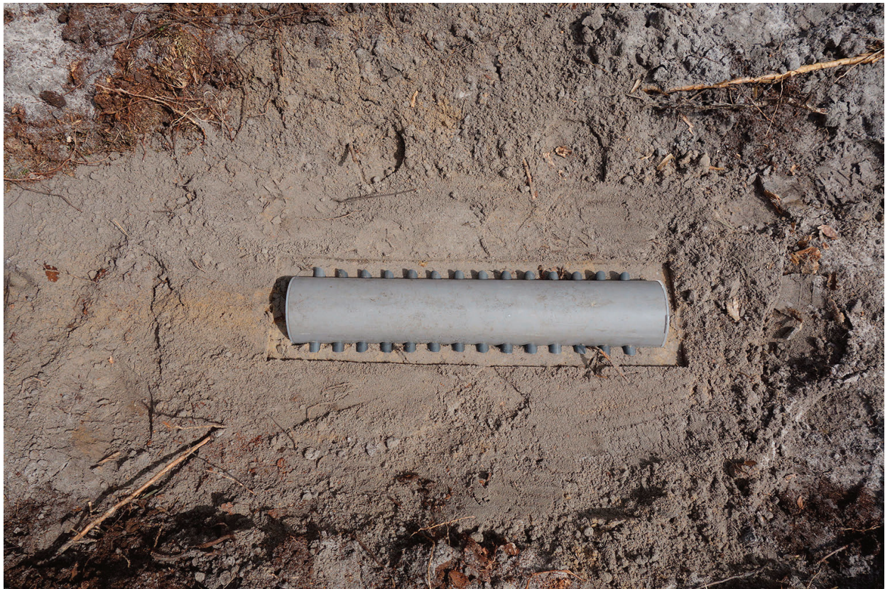
Photo 4. IBL-4 trap used for collection of Hylobius abietis beetles.

of the threat depends on the age of the trees and is critical for 3–10-year-old forests, when the number of eggs reaches, respectively, 50–1,500 per tree. Evaluation of threats by Tortricidea spp. is based on the estimation of the number of pine buds or higher shoots damaged by larvae. It is generally carried out from May 15 to June 15 and consists of the observations of 30 trees growing on the edge and 30 trees growing in the center of the forest. Critical damage is defined as damage of at least 30% of buds or shoots. A complementary method of Rh. buoliana observation involves the counting of butterflies attracted by pheromone traps installed before the start of swarming in the second half of June ( Table 2 ).