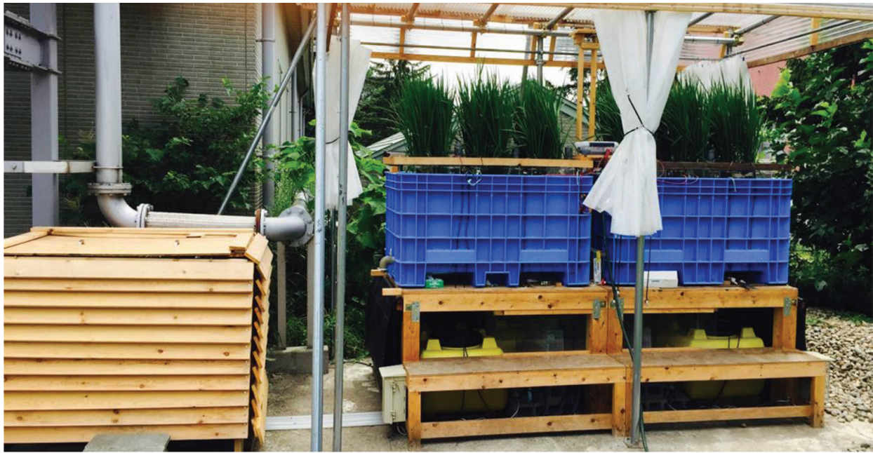
Figure 2. Bench-scale experiment to reveal the performance of treated wastewater irrigation to cultivate rice for animal feeding.

because of enhanced denitrification. This kind of irrigation seemed to increase the rice yield and biomass of the plants.