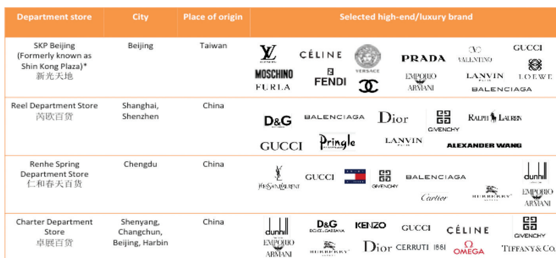
Table 1. Selected high-end/luxury department stores in China, as of May 2015.

These new trends affect not only customer behaviour and purchasing choices, but also the distribution of luxury products, both in largest and smaller cities. Despite the increasing popularity of e-commerce in China non-grocery specialists, in particular department stores, continued to dominate the distribution of luxury goods (Roberts, 2015; Fung Business Intelligence Centre, 2015). Although there were an increasing number of consumers who were keen on online purchases of products such as non-luxury clothing and footwear, beauty and personal care, and even some luxury accessories, when purchasing luxury goods (such as clothing, leather goods, watches) online they still had concerns about authenticity. Chinese consumers are more interested in the largest city's department stores ( Table 1 ) and shopping malls ( Table 2 ) that give them the opportunity to walk around and pick different global luxury brands.