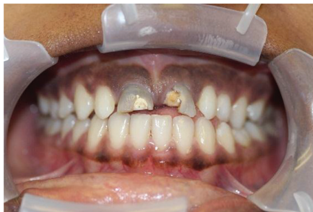
Figure 1. Generalized black-brown physiological melanin hyperpigmentation of the maxillary and mandibular gingiva, not transgressing the mucogingival junction. The patient's main concern was her carious incisors.

Physiological oral mucosal melanin hyperpigmentation manifests clinically as asymptomatic, single or multiple, well-demarcated or ill-defined patchy or uniform macules which range in colour from light to dark brown or black, and are of variable size and configuration. It may affect any part of the oral mucosa, but most frequently the gingiva, where it is usually bilaterally symmetrical, does not transgress the mucogingival junction, and does not involve the marginal gingiv ( Figure 1 ) [4, 6]. Physiological gingival melanin hyperpigmentation is often more pronounced in the anterior than in the posterior part of the mouth, and the buccal/labial surfaces are more intensely pigmented than the lingual/palatal [35].