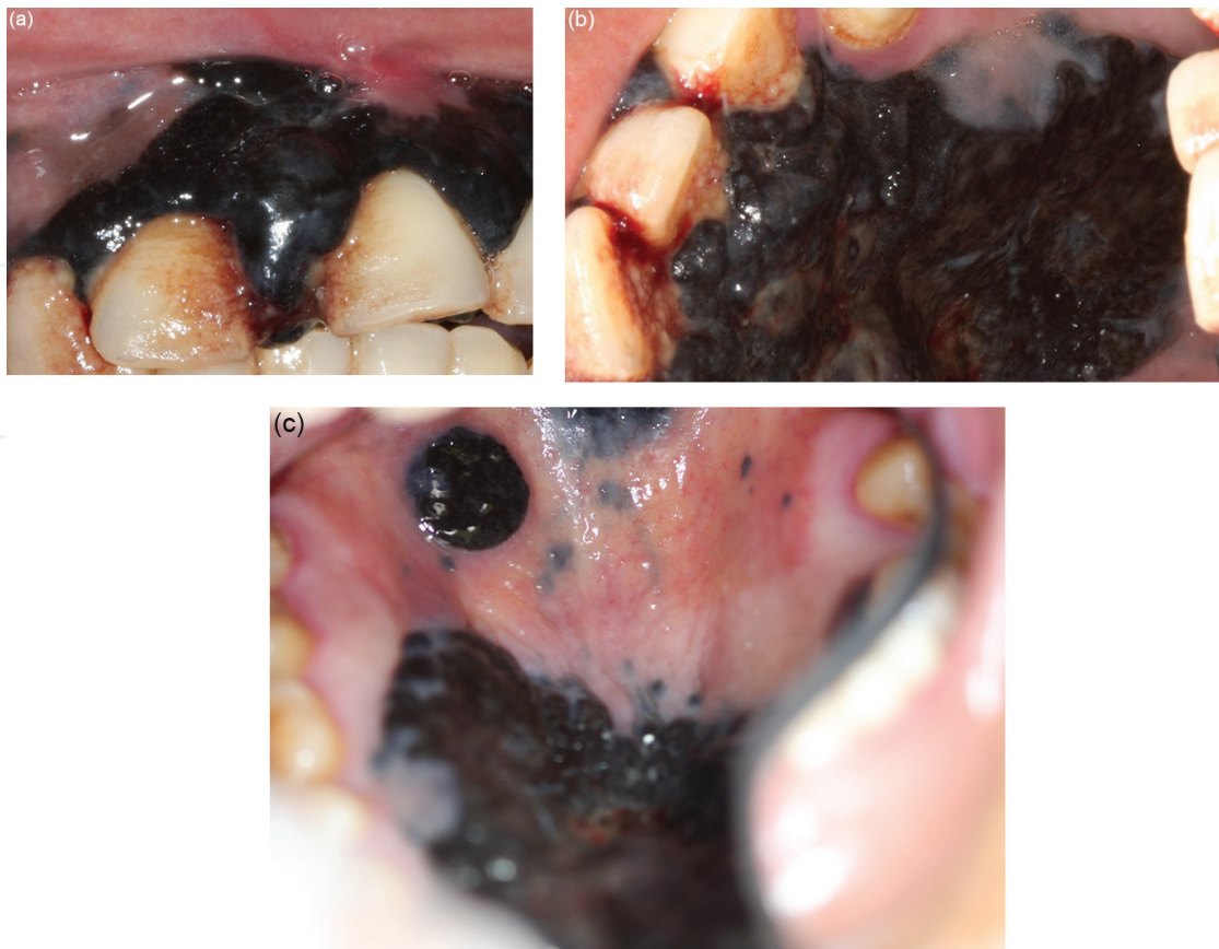
Figure 6. A 56-year-old black female with histologically confirmed melanoma of the hard palate and maxillary gingiva (a–c) of 3-year duration. It developed from a pigmented ‘patch’ of the buccal gingiva (reproduced with permission from Tlholoe et al. [15]).

the melanocytes, of toxic melanin particles, intermediates of melanogenesis and reactive oxygen species, with consequent DNA damage and increase in the risk of genetic mutations [59]. Furthermore, when leaked into the extracellular microenvironment, the intermediate metabolites of melanogenesis, which are also immunosuppressive, may promote evasion of immune responses by the initially transformed melanocyte precursors and their offspring melanoma cells, increasing the risk of melanomagenesis and melanoma growth [60].