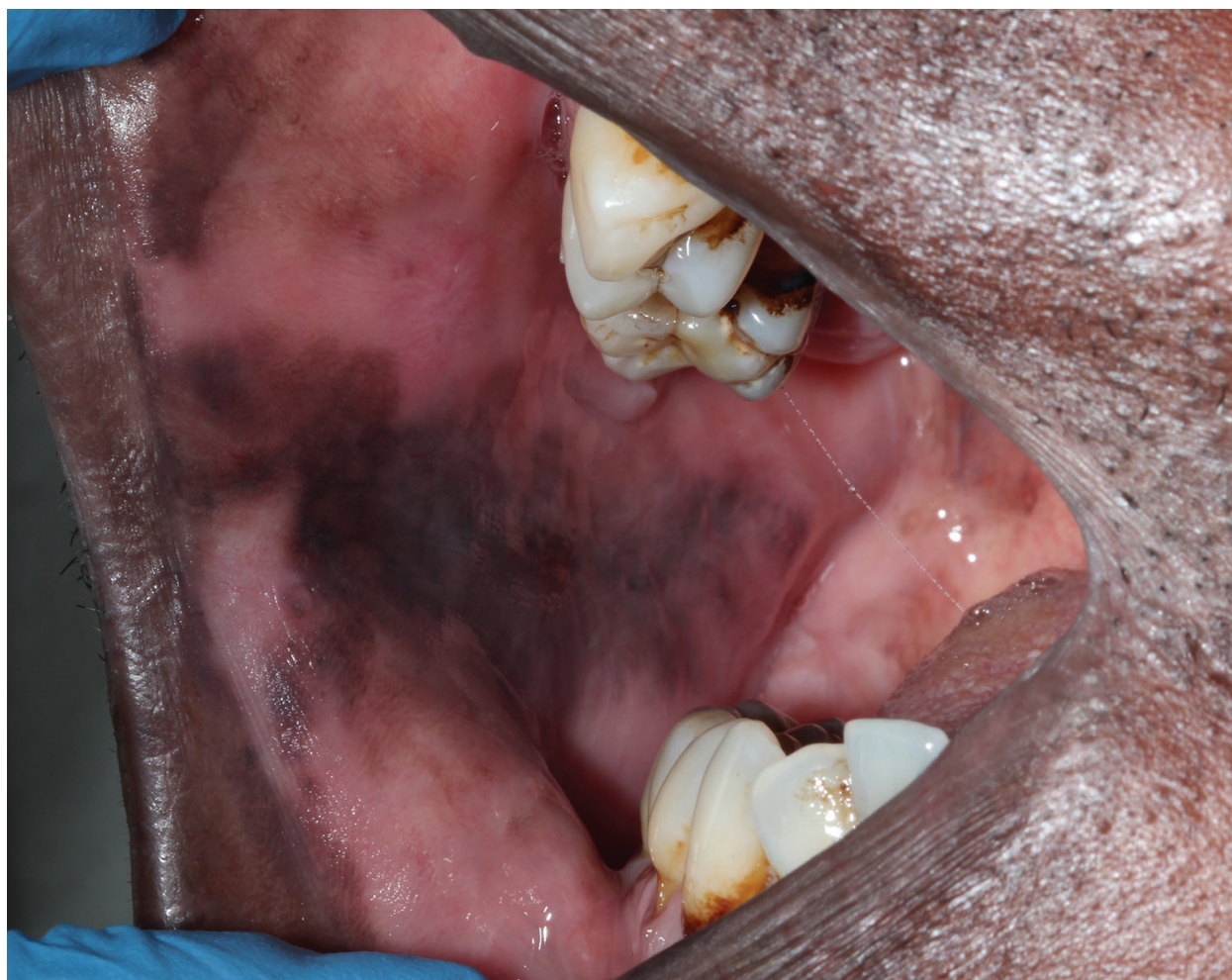
Figure 3. Irregular, diffuse, mottled hyperpigmentation of the buccal mucosa in a 40-year-old HIV-seropositive male with a CD4 + T cell count of 240 cells/mm 3 .

Apart from zidovudine used in the treatment of HIV infection, antimalarials, oestrogen, ketoconazole, clofazimine, and imatinib may mediate the development of oral mucosal melanin hyperpigmentation [12, 38]. There will usually be a gradual diminution of the hyperpigmentation after the medication is discontinued [6].