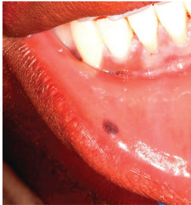
Figure 4. A 20-year-old male had this melanotic lesion of the lower labial mucosa, self-reportedly since birth. It was probably a congenital naevus but the patient refused biopsy. Note also the physiological gingival melanosis.

The palate and the gingiva are the oral mucosal sites most frequently affected. Up to one-third of oral mucosal melanomata arise from pre-existing benign oral mucosal hyperpigmentations [15, 47–49] and the remaining two-thirds arise de-novo [15, 44, 50, 51].