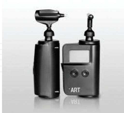
Figure 2. The bioresonator applanation resonance tonometer (ART).

BioResonator ART IOP measurements have been demonstrated to be affected by CCT [15, 17]. The overestimation of the IOP measurements obtained with ART relative to GAT has been demonstrated in previous studies [17].