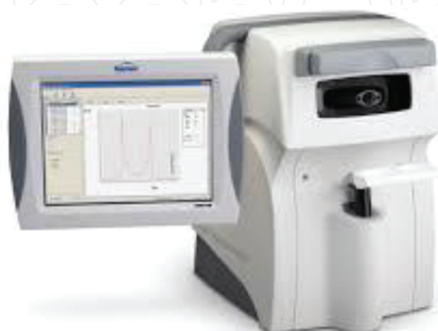
Figure 4. The ocular response analyzer (ORA).

applanation. This device is based on the principle that information on corneal biomechanics can be obtained by measuring the corneal deformation in response to an air impulse. The ORA uses an electro-optical infrared system to monitor the 3-mm central cornea [23]. The puff of air moves the cornea in an inward fashion, which is considered as the first inward applanation creating a mild concave form. As the force generated by the air decreases, the surface of the cornea takes on the normal convex form in this second outward applanation phase.