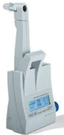
Figure 3. The pascal dynamic contour tonometer (DCT).

The pascal dynamic contour tonometer (DCT) ( Figure 3 ), developed by Kaufmann et al. [18], is not based on corneal applanation. It has a concave measuring tip, which is applied on the corneal surface to provide a “contour matching” with the aid of a built-in sensor, which is representative of the pressure inside the eye. The Pascal DCT should be therefore less influenced by corneal properties. Previous studies have shown that there is a good concordance between Pascal DCT and GAT in eyes with normal corneas [19]. In eyes that have undergone laser in situ keratomileusis (LASIK), the Pascal DCT appears to provide a more reliable measurement of IOP than GAT, which tends to measure artificially lower IOP values [20].