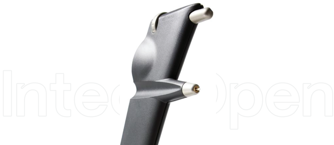
Figure 1. The iCare rebound tonometer.

The iCare (Tiolat Oy, Helsinki, Finland) is routinely used in clinical practice in several clinics nowadays. The device is handy and light-weighted (250 g) [7]. It is composed of a small disposable thin metal probe (about 5 cm in length and 1 mm in diameter) and a solenoid and magnet housed in a metal case. The tonometer is placed in front of the eye, using the forehead to properly position the tip of the probe about 5 mm from the central cornea. The button is pressed in taking IOP measurements, which activates an electric signal that is sent to the solenoid and magnet to move the probe forward. The tip of the probe hits the cornea, rebounds and induces a voltage in the solenoid, which amplifies the signal to a microprocessor. It is advisable to take at least six readings, so that a mean IOP can be calculated by the built-in software [7].