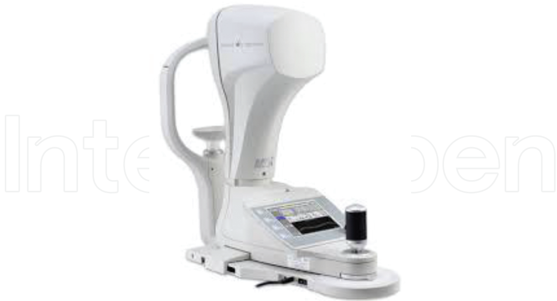
Figure 5. The Corvis ST pachy-tonometer.

The Corvis ST (Oculus, Wetzlar, Germany) released in 2013 [25] uses a quick burst of air (with a Gaussian distributed intensity and duration of 25 ms) on the center of the cornea that causes the initial inward applanation. The cornea then returns to a normal convex shape as the force of the air decreases to provide outward applanation. The Scheimpflug camera precisely records the corneal movements and records more than 100 images in about a half of a second with a resolution >600 \times 400 pixels, for a central corneal surface of about 8.5 mm. The numerous corneal scans without the influence of the air puff are used to provide pachymetry readings. The first applanation phase is used to determine IOP measurements, which is not corrected for CCT and corneal deformation parameters (CDPs). The Corvis ST printout provides IOP and CCT measurements and 10 numerical corneal deformation parameters (CDPs), whose importance remains to be fully elucidated. They have been demonstrated to be highly sensitive to IOP that suggests their variation in relation to normal and pathological short- and long-term IOP fluctuations [26]. On the other hand, they are also known to be affected by IOP-independent variables, including patient age, CCT, corneal hydration, corneal stiffness and boundary conditions related to the sclera and the ocular muscles [26].