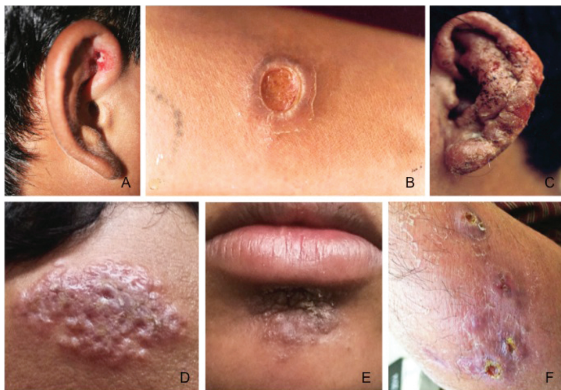
Figure 1. Clinical spectrum of the LCL in southeastern Mexico. (A) Acute ulcerated lesion on ear; (B) typical small, rounded, ulcerated lesion in forearm; (C) chronic lesion on ear; (D and E) nodular infiltrated lesions; (F) multiple ulcerated lesions in forearm.

appearance of multiple lesions ( Figure 1D–F ). Those findings are suggestive of changes in pathogenicity of the parasite that need to be studied.