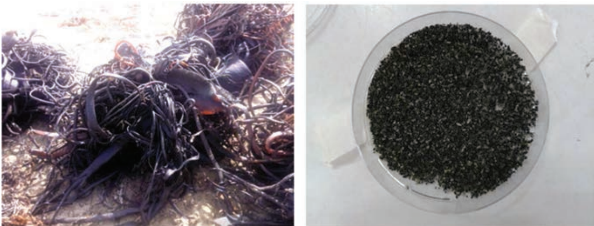
Figure 1. Brown algae Durvillaea antarctica . Left, a specimen freshly collected from the coastal line. Right, a sample of milled Durvillaea antarctica biomass with a size of 500–1000 \mu\text{m} .

thanks to molecular systematics, a good progress has been made in the classification of these organisms, solving the problem of underestimation of diversity when considering only morphological characters [12]. There is great interest in the commercial use of the chemical constituents present in the seaweeds, in the field of energy production, agriculture, food, environmental, and pharmaceutical industry. The global harvest seaweed for food and algal products (e.g., Agar, alginates, and carrageenan) exceeds 3 million tons per year, with a potential harvest estimated at 2.6 million tons for red algae and 16 million tons brown algae [13]. Of particular interest is the use of seaweed dead biomass as biosorbent of heavy metals in solution. Multiple studies have shown a high sorption capacity and selectivity for different metal cations attributed to the polysaccharides present in their cell walls [4, 5, 8, 9, 14–18]. The basic organization of their cell walls comprises a fibril skeleton mainly composed of cellulose, and an amorphous matrix of sulfated galactans constituted by carrageenans and agar in red algae and alginates or alginic acid and fucoidan in brown algae ( Table 1 ). Studies to assess