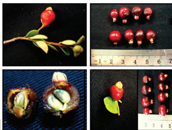
Figure 3. Myrceugenia obtusa or “Rarán” fruits. These berries have antioxidant and antibacterial activities (Orellana et al., 2017).