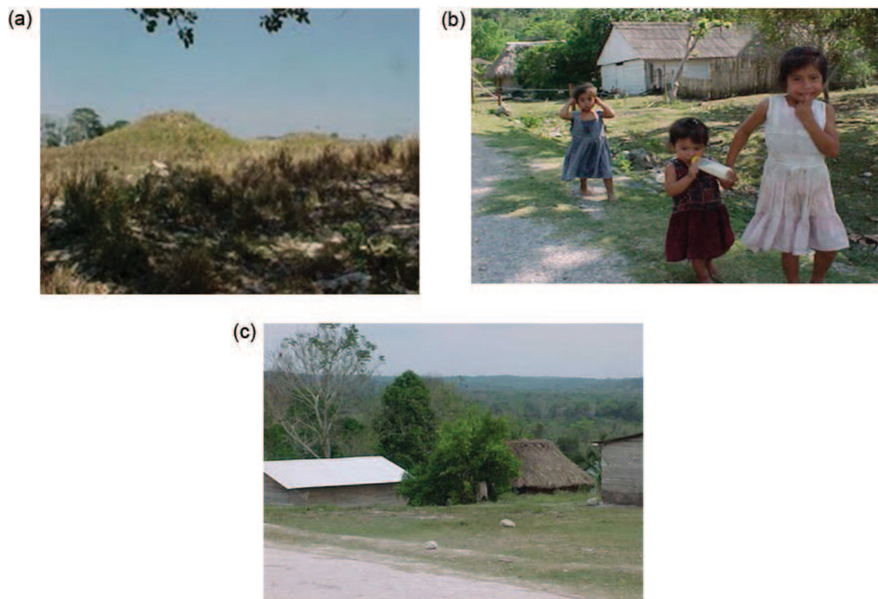
Figure 3. Communities situated in the leishmaniasis endemic region of Gulf of Mexico. People in these villages farm chili crops around their houses, located very near the forest close to the border of Belize and Guatemala.

characteristically tropical rain forest, with considerable rainfall and important agricultural activities, including the production of cocoa, sugar cane, and rubber. We collected isolates from patients with DCL or LCL in these states and some from Campeche. Their DNA was amplified with primers M1 and M2 [17] specific for kDNA of L. mexicana complex. The size of PCR products (680–720 bp) of the Mexican isolates is more similar to the size of the PCR products (700 bp) of L. (L.) amazonensis group than the PCR products (800–820 bp) of L. (L.) mexicana BEL21. The isolate PCR products hybridized with probe 9.2 specific for the L. mexicana complex. Their DNA was also analyzed using ITS1 PCR-RFLP, and we confirmed the presence of both DNA of L. (L.) amazonensis and L. (L.) mexicana in the same isolate (Table 2) [12, 17].