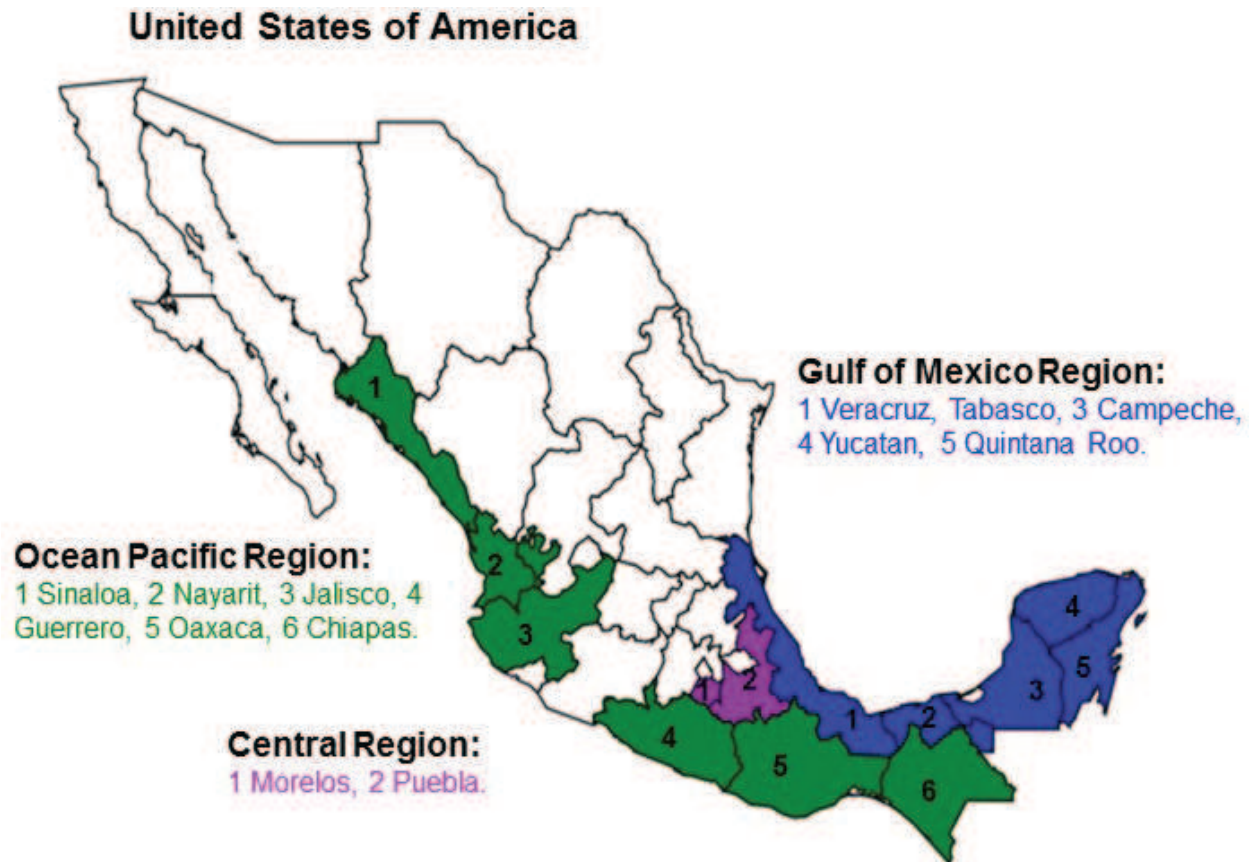
Figure 1. Map of Mexico, showing the Ocean Pacific, Gulf of Mexico, and Central Leishmaniasis endemic regions.

Veracruz, Nayarit and Chiapas, and Quintana Roo—or samples from VL patients from Chiapas and Tabasco states. The clinical samples were taken on filter papers or smears, needle aspirates, and tissue biopsy samples (1–2 mm) from the edge of cutaneous or bone marrow aspirates (Figure 1).