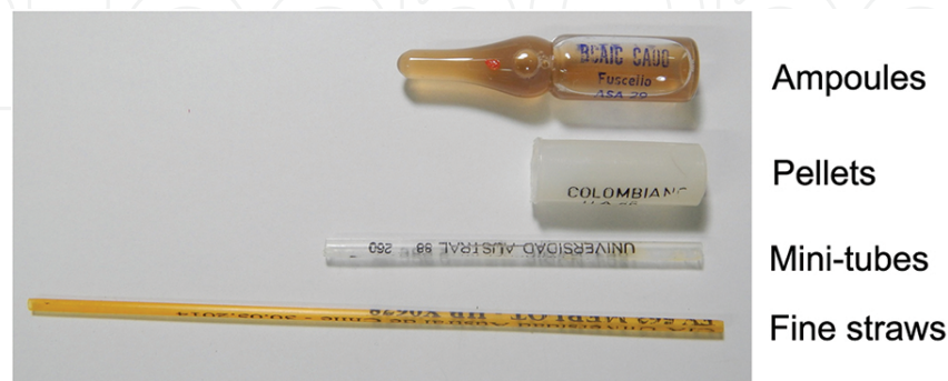
Figure 1. Different freezing packaging system used in this study.

respectively. As a control, commercial frozen doses cryopreserved in fine straws and stored in liquid nitrogen for 1 year were used. The following thawing protocols were used, in accordance with cryopreservation packaging supports (that is showed in Figure 1 ): Ampoule samples were thawed in thermo-stated water bath at 50°C for 75 s; pellet samples were thawed in a Thermo-stated water bath at 40°C for 55 s; short straw (Mini-Tubes) and fine straw samples were thawed in a thermo-stated water bath at 37°C for 30 s.