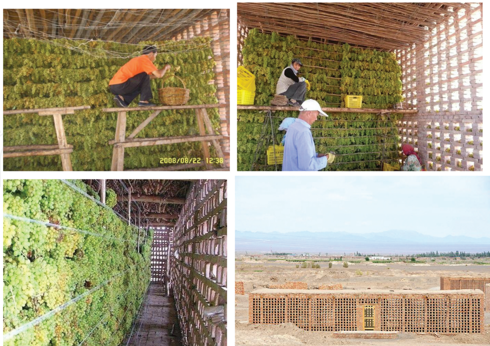
Figure 3. Shade drying of grape into raisin and the structure of shade-room.