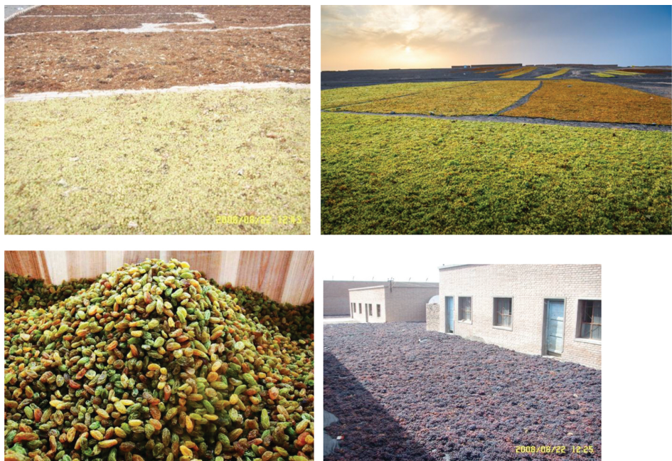
Figure 2. The open sun drying of grape into raisin.

that different temperatures have a significant effect on aroma profile of musts from the dried grapes, a less loss of raisiny aroma for a lower temperature was found.