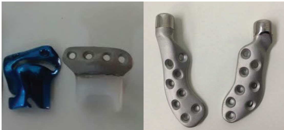
Figure 4. Customized cutting guide; fossa component; mandibular component.