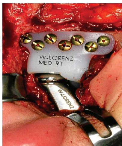
Figure 2. Installed stock prosthesis W. Lorenz. The metallic component of condylar articulating against PUAPM pit fixed with titanium screws is observed [21].

The latest inventory prostheses (W. Lorenz TM ) used nowadays have two components: a condylar composed of cobalt-chromium-molybdenum alloy (Cr-Co-Mo) and titanium alloy coating (Ti-6Al-4V), and a component of the composite cavity of ultra-high molecular weight polyethylene (PUAPM) ( Figure 2 ). It also presents evidence of fixtures, with the compound condyle Aluminum and Radel TM plastic tank. Both components are available in various sizes as well as in specific designs for the right and left sides, being fixed to bone by titanium screws [9–21].