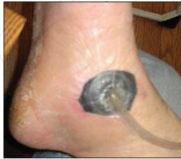
Figure 2. Vacuum dressing on small oozing wound (Courtesy of WWW.REHABPUB.COM).

VAC therapy is a simple but effective method of promoting rapid healing. It is currently considered to be an effective means of managing large complex acute and chronic wounds ( Figures 1 and 2 ) [27].