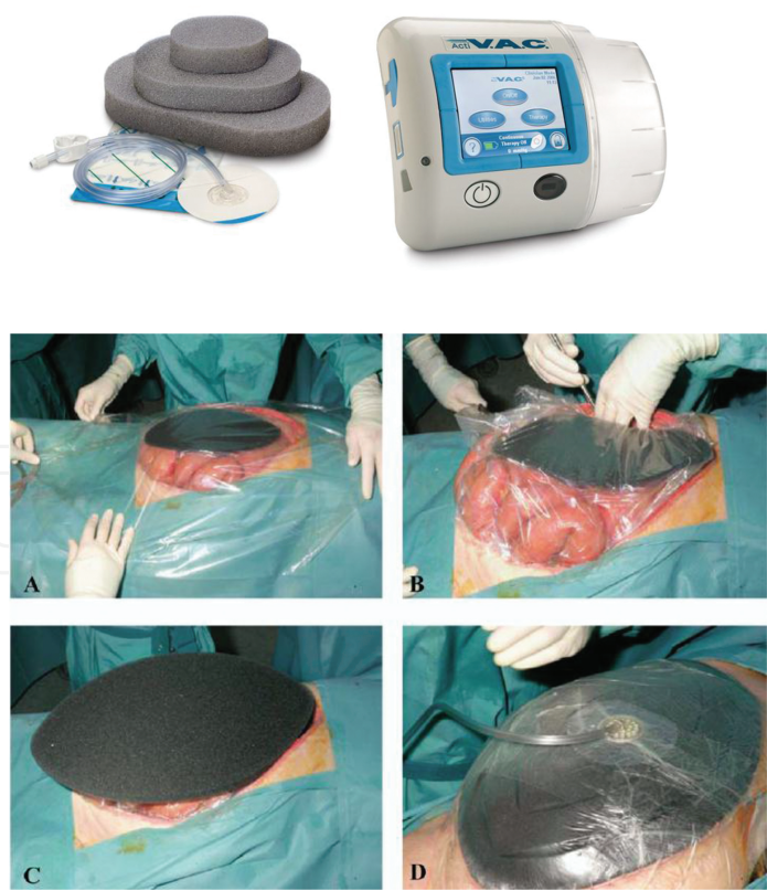
Figure 1. Prospective evaluation of vacuum-assisted closure in abdominal compartment syndrome and severe abdominal sepsis, J Am Coll Surg. 2007; 205 : 586–592 (Courtesy of KCI medical).

The concept of tissue viability nurses is relatively new though the idea originated in the 1980s. It covers all aspects of skin and soft tissue wounds. Although surgical wound management is a major part of their role, it is not their sole field of expertise. They also cover various soft tissue-related areas such as pressure sores and chronic leg ulceration. In addition to their bedside role, they provide education to the entire healthcare team. Across the UK, they are also working on preventing common hospital-related skin problems like pressure sores, thereby saving costs in the long term. Their role extends into the community where they provide support to district and practice nurses and help them to choose the correct dressing material and other essential tools for wound healing. The Tissue Viability Society has been established since 2014 and it is considered an excellent forum to discuss all new techniques and materials used for wound healing [26].