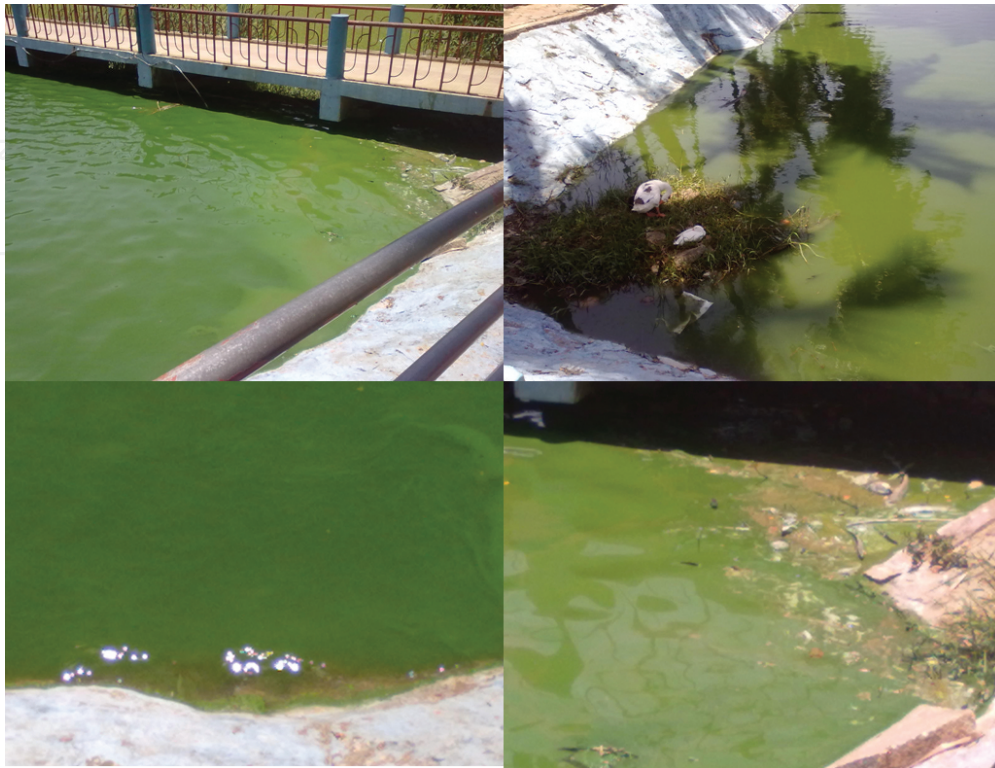
Figure 2. Lake condition before treatment at different locations.

concentration of 35.44 and 1.45 mg/l, respectively COD and BOD were also high at 323 and 64 mg/l, respectively.