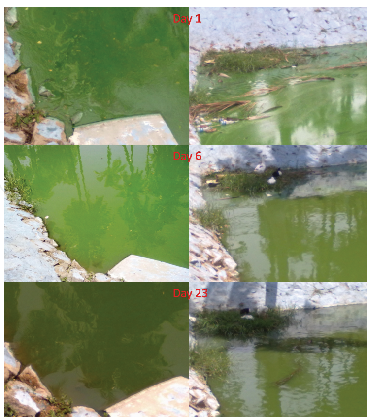
Figure 3. Visible change in water colour and BGA layer during treatment with Nualgi.