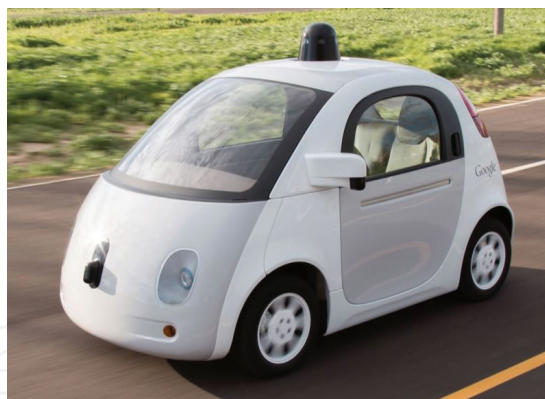
Figure 3. Google self-driving car.

The technological improvements in numerous dissimilar segments are effecting the UAV technology too, like media and entertainment. With the help of the lately used drones are easily operated, simple and cheap widely used by the professionals likewise amateurs in various applications. This option introduces some hazardous results with the ease of the system. Although the price of the simple applications like drones less when it is compared with the complex vehicles, consequences could be analogous.