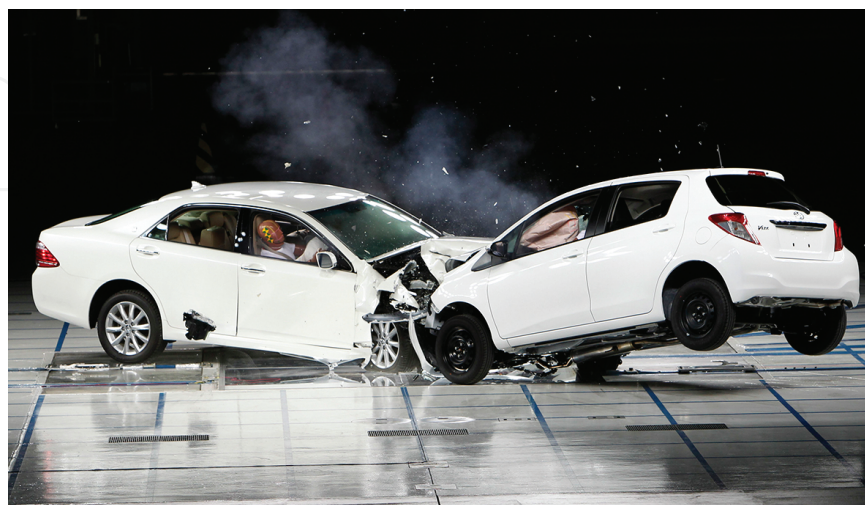
Figure 6. Vehicle-to-vehicle impact test of Toyota Motor Company.

The tests can be classified in three categories: component tests, sled tests, and full-scale barrier impacts. Because of the complexity and many distinct test variables in full-scale tests, there is an acceptable reason in the reduction of the test's repeatability. The impact test depicted in (Figure 6) is representing a full-scale vehicle-to-vehicle impact test of Toyota Motor Company while they are developing a new safety system for their automobiles [18]. The dynamic and/or quasi-static response of an isolated component is defined by the component tests are exalted to detect the crush mode and energy absorbing ability. With the help of the component tests, it also gives the capability to the designers to develop prototype substructures and mathematical models. Moreover, the vehicle rear structure full-scale tests are governed either via a deformable barrier or a bullet car to state the integrity of the fuel tank. To evaluate roof strength according to FMVSS 216, a quasi-static load is applied on the "greenhouse," and providing that the roof deformation falls below a particular level for the applied load [6].