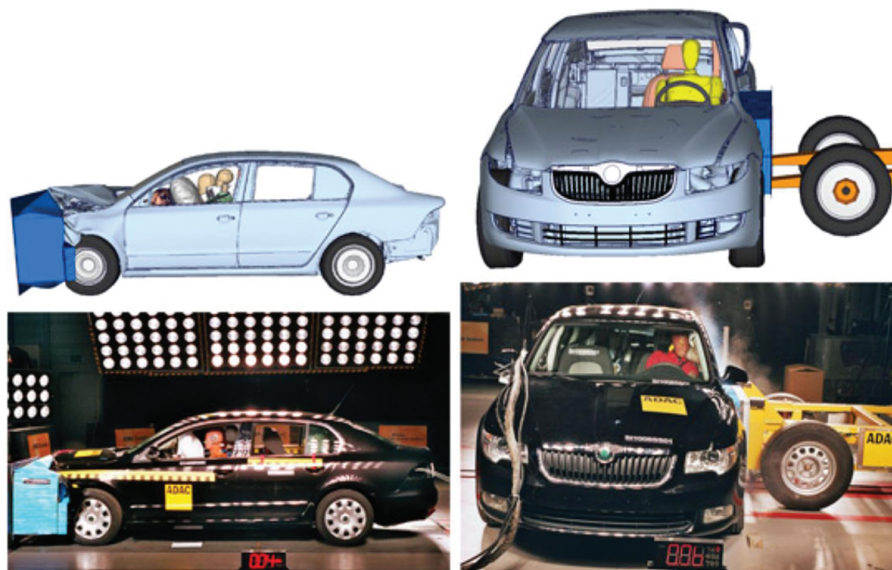
Figure 7. The vehicle crash test and simulation.

When the simulation is processed, the finite element model is ready for the post-processing. The most considerable issue for the impact is absorb or get rid of the shock energy by different methods like geometrical change of the structure, material selection, and application. The second problem is the large deformation of the structural components. Additionally, changing the parameters of the simulation model will affect the results widely depending on the experience of the analyst. Because of dealing with the highly plastic problems and non-linearity during collisions, the analyst needs to possess deep knowledge about nonlinear finite element analysis for continuum mechanics [20–22]. It should be stated that the analyst can be faced with the geometrically nonlinear problems or material nonlinearities which is imported to be expressed.