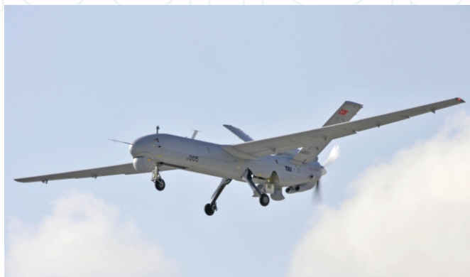
Figure 2. Medium Altitude Long Endurance (MALE) UAV of Turkish Aerospace Industries, Inc.

zones and decrease the threats by the enemies or the terrorists. An unmanned aerial vehicle (UAV) shown in Figure 2 in Ref. [13], widely used as a drone, or an unmanned aircraft system (UAS), and also referred by several other names, defines an aircraft without a human pilot. Therefore, an aircraft without a pilot means, alive human, but in the right hands yet, this sophisticated technology will be so perilous against innocents. And also, the more professionally UAS requires the more trained and talented personnel in particular formidable and arduous duties. This can possibly cause unexpected mistakes during the tasks that provoke impacts and collisions.