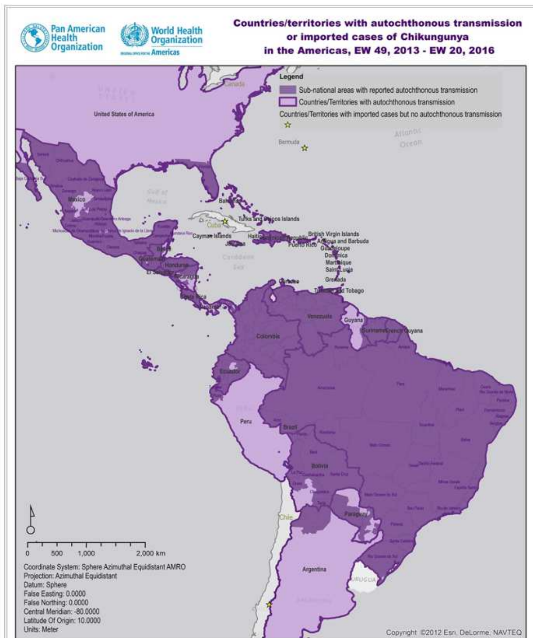
Figure 2. Countries/territories with autochthonous transmission or imported cases of chikungunya in the Americas, EW 49, 2013–EW 8, 2016.

a short time almost all the countries in the region are reporting indigenous cases with the exception of Chile and Uruguay (Figure 2).