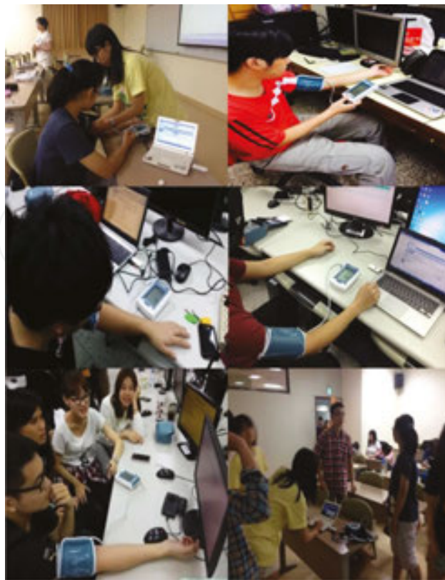
Figure 3. The joint interdisciplinary learning process for cloud-based BP healthcare solutions in the courses of tele-BP healthcare and BP healthcare for smart aging.