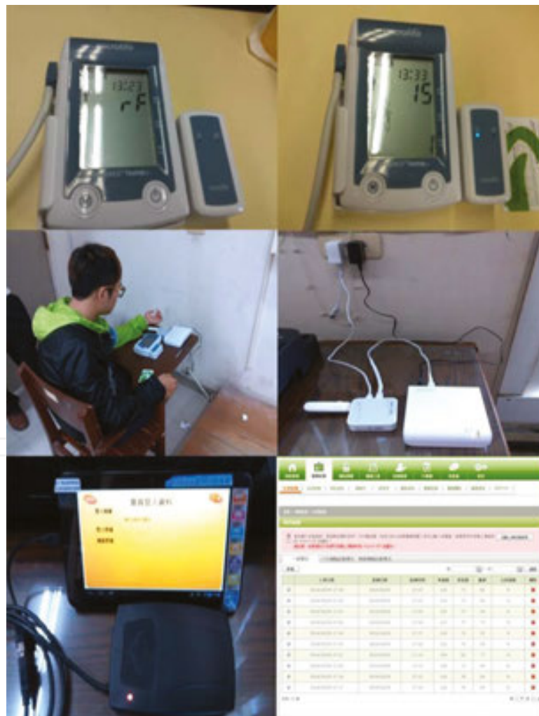
Figure 8. A learning tool developed by Microlife Corporation for 3G mobile agent and cloud-based multiuser real time BP measurement system.

A learning tool developed by Microlife Corporation for 3G mobile agent and cloud-based multiuser real-time BP measurement system is shown in Figure 8 . The 3G mobile agent and cloud-based multiuser real-time BP measurement system includes radiofrequency identification (RFID) cards, a Bluetooth-based sphygmomanometer, 3G gateway with Bluetooth network, 3G mobile modem, auto login sensor, and tablet. Each user has an RFID card, such as an Easycard, or a student card, to identify the user number. The Bluetooth-based sphygmomanometer is in a shutdown state. When the RFID-based student card senses the Bluetooth-based sphygmomanometer, the device is turned on, and the BP is measured. Real-time BP values are transmitted to the 3G gateway via the Bluetooth network, and a 3G mobile modem is used for transmission of these values to a cloud-based BP platform. When the RFID-based student card senses auto login, the auto login sensor uses the 3G mobile modem to login into the cloud-based BP monitoring Web page, and the real-time BP values in the Web page are displayed on the tablet. Each user can access BP reports on the cloud-based Web page at any instance from any global location.