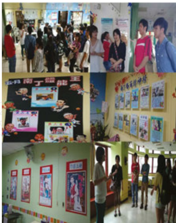
Figure 5. The interdisciplinary course outline of tele-BP healthcare for smart aging also included a visit to the Nightingale Nursing home for Smart Aging, Taichung, in June 2014.