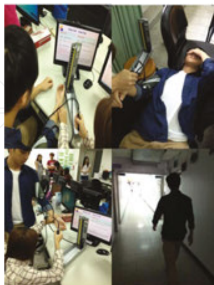
Figure 1. Several BP measurements for the same personal taken in different situations.

In the experiment-based learning process, interdisciplinary students can understand the principle and technology of mobile BP healthcare solutions for smart aging. Figure 1 shows several BP measurements for the same personal, taken in different situations. The systolic BP values for lying, sitting, standing, and walking are 122, 123, 128, and 136 mmHg, respectively. The diastolic BP values are 62, 70, 75, and 90 mmHg, respectively. We observed the range of the systolic and diastolic BP values by taking measurements in several situations. The maximum measurement value of BP is reported for walking, and the minimum measurement value is reported for lying.