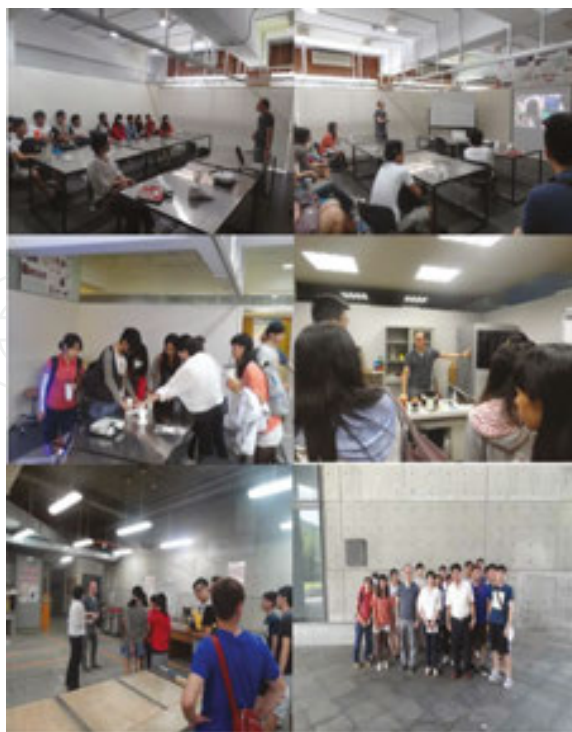
Figure 4. The interdisciplinary course outline of tele-BP healthcare for smart aging included a visit to the Department of Industrial Design, Shih Chien University, in July 2, 2014.