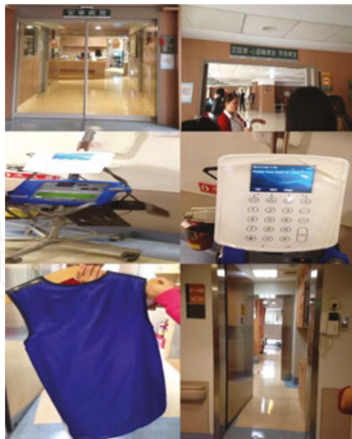
Figure 6. The interdisciplinary course outline of BP healthcare for smart aging included a visit to a hospice and iodine 131 wards at Chang Cung Memorial Hospital, Keelung Branch, in November 2014.