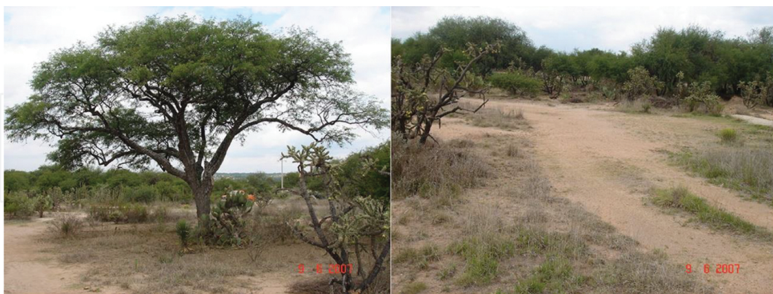
Figure 1. Under the canopy tree of mesquite (U), Outside the canopy of mesquite (O).

The soil was sampled from three sites: Two around mesquite trees ( P. laevis ), the dominant vegetation (Dolores Hidalgo, Guanajuato, Mexico), under the canopy and outside the canopy of mesquites ( Figure 1 ), and the third one from a site cultivated with maize ( Zea mays ) for 20 years.