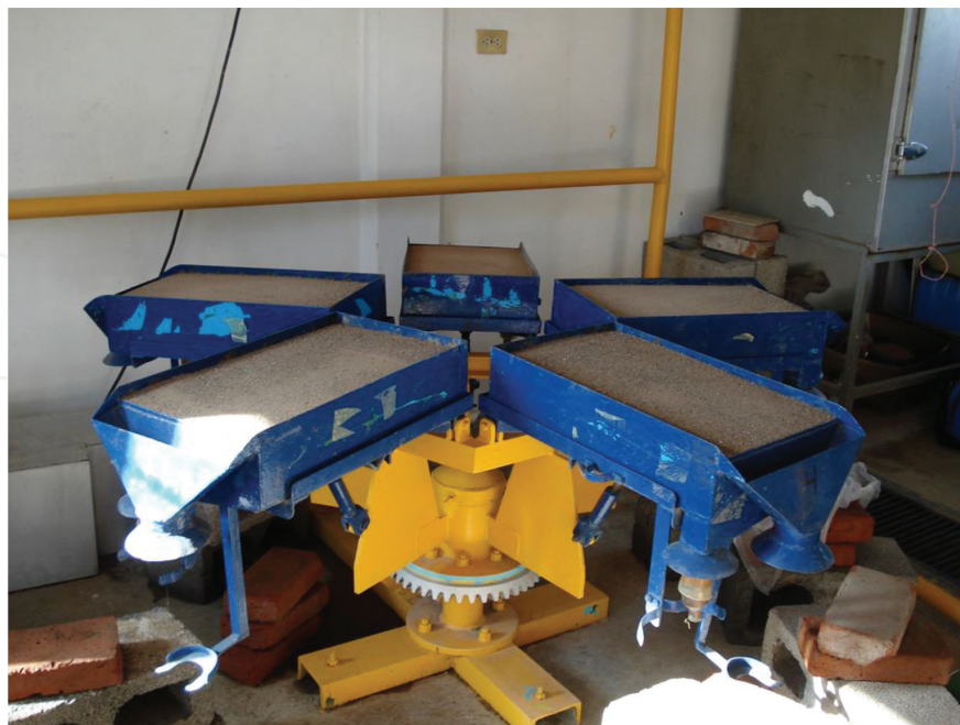
Figure 2. Rainfall system type Morin.

For the experiment of simulated rainstorm, the rainfall system type Morin [47] was used (Figure 2).