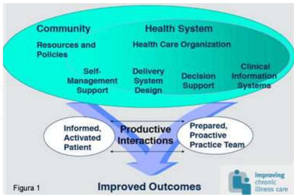
Figure 1. Chronic Care Model (reproduced with permission).