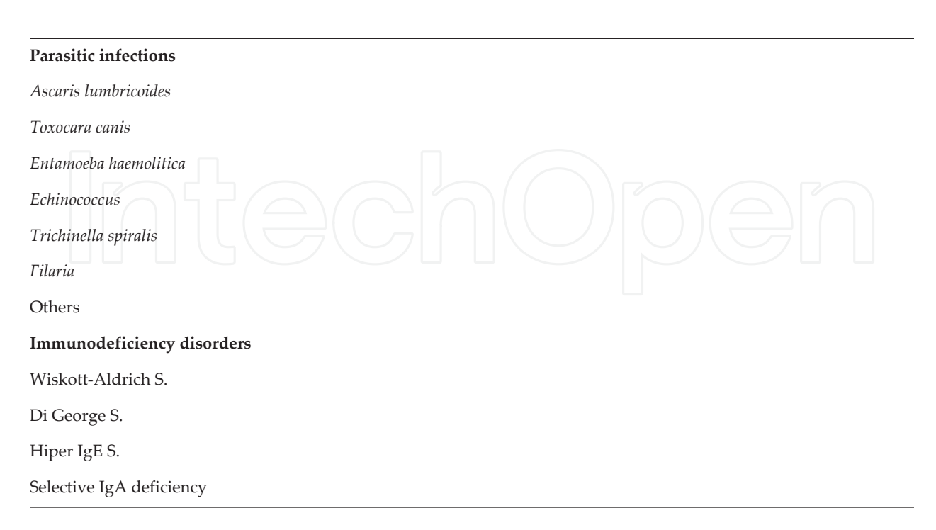
Table 3. Non-allergic process more frequents in small children that occur with high IgE.

Table 2. Normal serum IgE levels (Kjellman and Johanson, 1976).