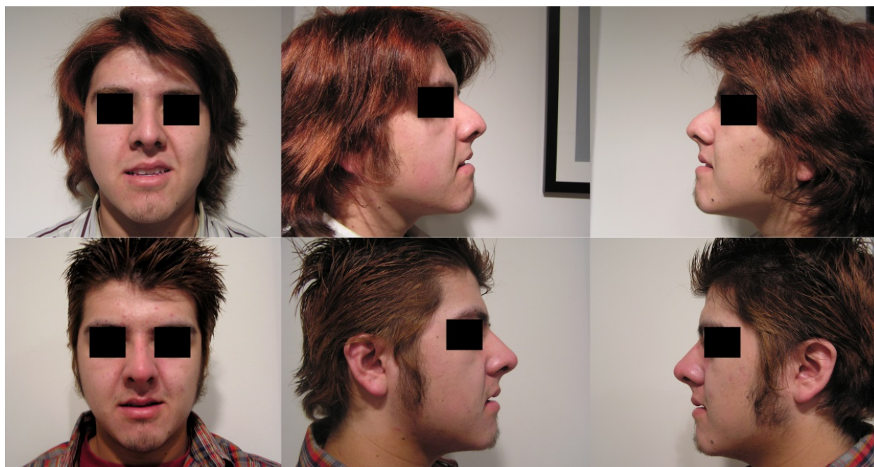
Figure 1. CaHA NSR to lift a ptotic nasal tip and augment the nasal radix. The “Before” pictures are on top, “After” on the bottom. The net result is a straighter nose on profile that appears smaller because it blends better into the rest of the face.