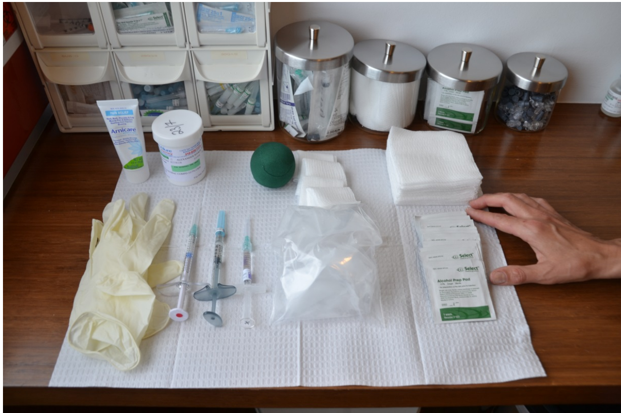
Figure 4. Equipment necessary for NSR. Radiesse, Voluma, and Perlane are all displayed with the first two as presplit half syringes (using a Luer-Lock connector and a 1cc syringe). I try to use the smallest possible needle gage – 27 or 28 G thin-walled needles are my preference. The photograph displays the four main methods of pain control in my injectables practice. Topical numbing cream is a compounded 23% Lidocaine, 7% Tetracaine mixture. Ice and a stress ball are important, but most important is my assistant's hand, which distracts the patient by tapping on the shoulder opposite to where I am standing.

About a third of my NSR patients are Asian, as in Fig. 6. These patients commonly desire an increase in the height and definition of their dorsum and radix, as well as improvement in the definition and projection of their nasal tip. These patients are usually young and cannot afford surgery. They are also often wary of unnatural surgical results, describing people with visible or overly large dorsal grafts that they have seen in the Asian community. Like many patients who opt for this procedure, they want to see the cosmetic change they desire, but only if their nose retains a natural appearance and no one can tell that they have had an aesthetic procedure.