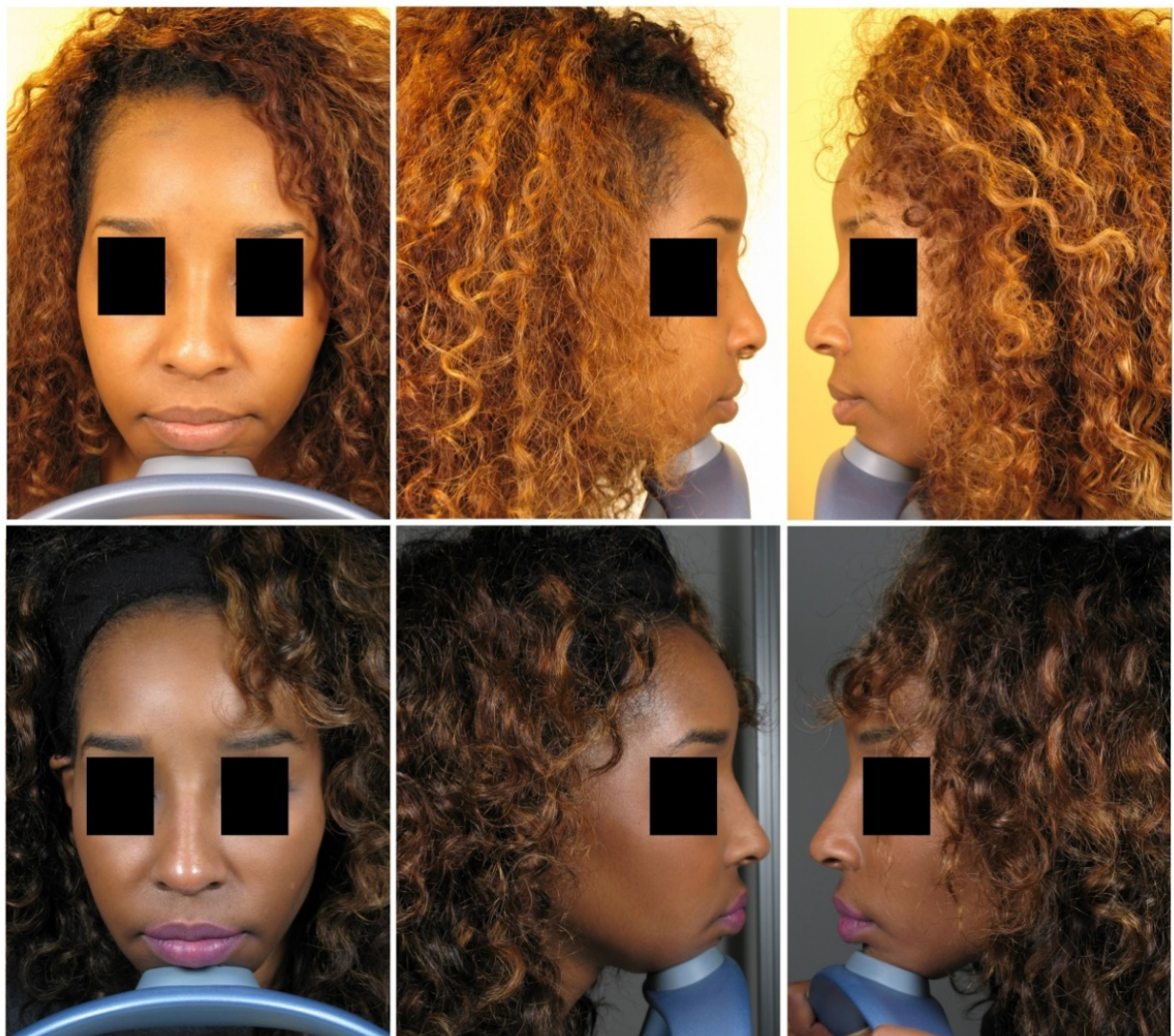
Figure 3. Artefill NSR to refine and straighten the dorsum and tip from both the profile and straight on views. This patient wanted to have a thinner appearing nose from the frontal view and a straighter and more refined looking dorsum and tip from the profile.

day, as well as heavy sunglasses for two weeks. I agree with Kim and Ahn's observation that the volume effect of most fillers decreases by about 25% within the first month or two [19]. For this reason, my procedure includes a complementary follow-up visit 3 weeks after the initial injection, where I can touch-up the results.