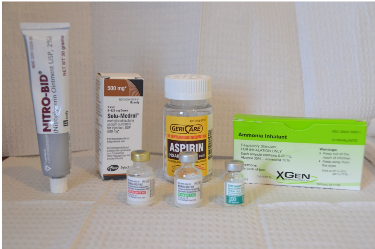
Figure 9. My in-room safety kit. Pictured are Hyaluronidase, Nitopaste, Aspirin, Kenalog, Solu-medrol, and smelling salts. These are the medications important to have on hand in every room.

damage continues to unfold, the injector should consider hyperbaric oxygen therapy and referral to a plastic surgeon. My in-room safety kit, a.k.a. injectables “crash cart” is illustrated in Fig. 9.