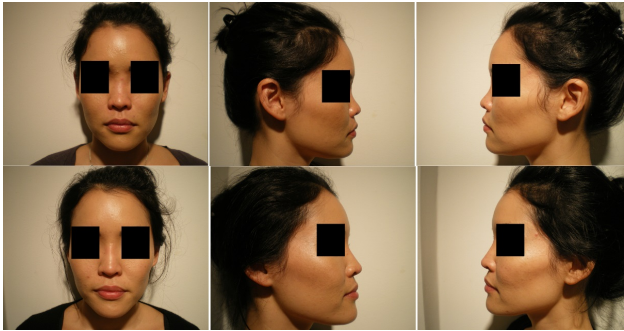
Figure 6. CaHA NSR to augment and better define a nasal bridge and tip in an Asian patient.

and limits the lift that can be achieved with filler injection. Injectors need to take care not to over-promise these patients. Their results are going to be, for the most part, relatively subtle. Most importantly, postsurgical skin has a more tenuous blood supply, especially around the tip and ala. The risk of ischemia and necrosis are significantly increased in these patients. Only the most experienced injectors should be treating them, since the complications of necrosis can be catastrophic.