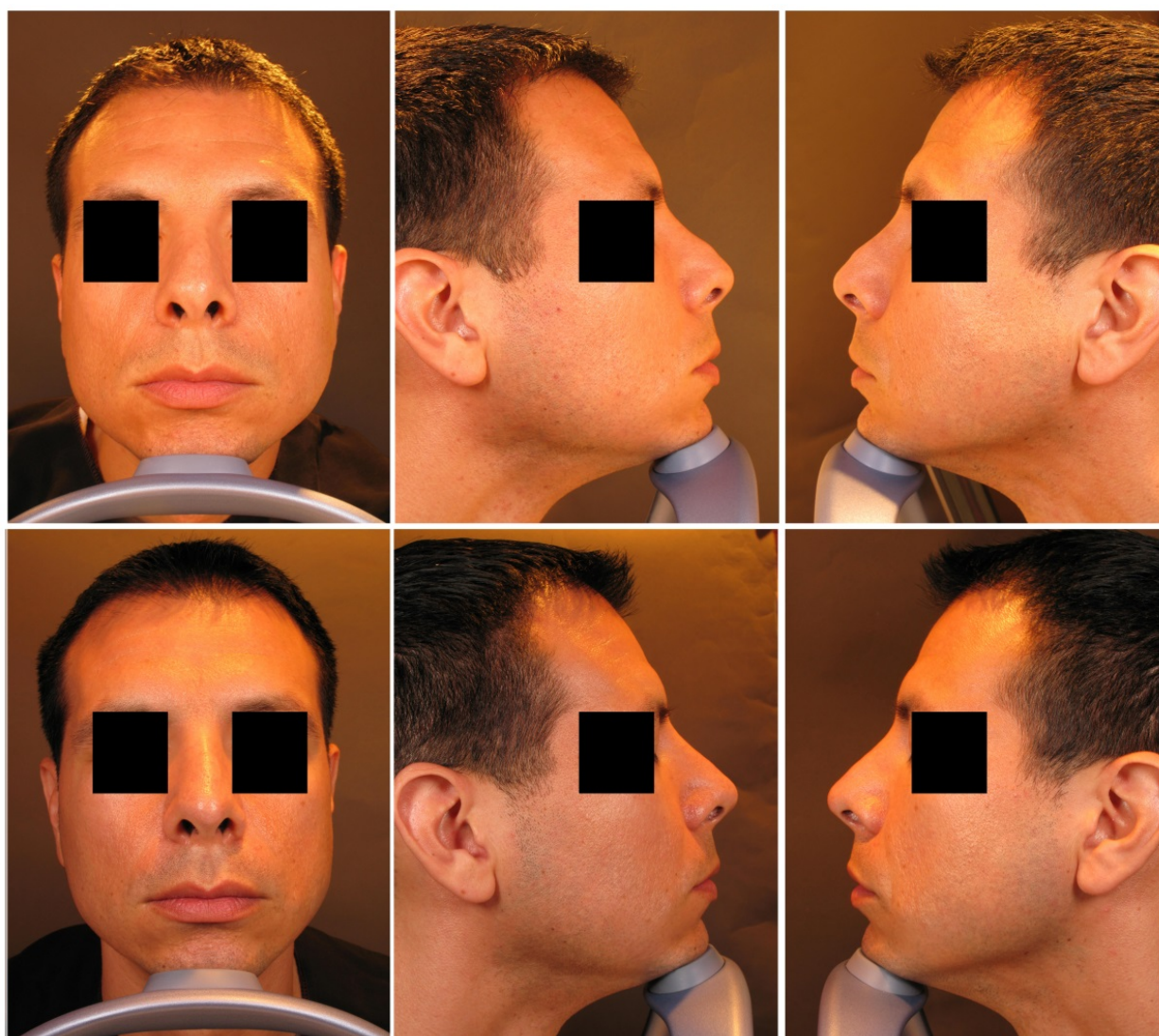
Figure 7. Artefill NSR to correct postsurgical contour irregularities and asymmetry of the dorsum and to lift the nasal tip. Lower series are 1 year after the last of three sessions of Artefill injections.

at any sign of danger. Our traditional understanding of the vascular anatomy of the external nose is illustrated in Fig 8.