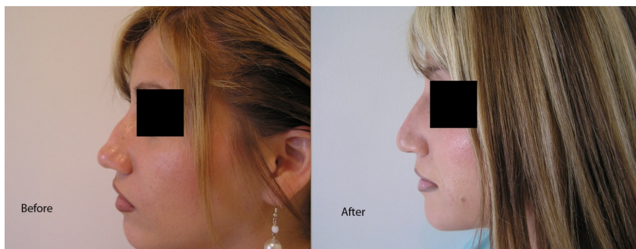
Figure 2. HA NSR to camouflage a dorsal hump. The patient wanted to use a minimum of product to make her profile straighter. She believed a slight curve would make her nose look more natural.

tendency to spread, so better definition can be achieved. Perlane also lasts somewhat longer in the nose than Juvederm and Perlane – about 8 months in my experience. Prior to the FDA approval of Voluma, I used Perlane for patients who wanted the added safety of a reversible filler.