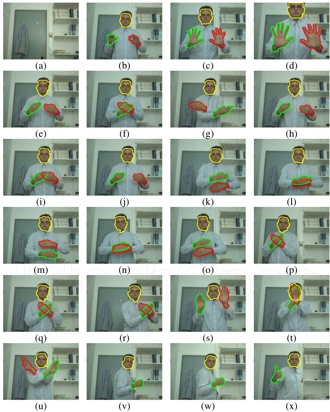
Figure 2. Characteristic snapshots from the on-line tracking experiment

Later on, the person starts applauding which results in his hands touching but not crossing each other ((h)-(j)). Right after, the person starts crossing his hands like tying in knots ((k)-(o)). Next, the hands cross each other and stay like this for a considerable amount of time; then the person starts moving, still keeping his hands crossed ((p)-(r)). Then, the person waves and crosses his hands in front of his face ((s)-(u)). The experiment concludes with the person turning the light on and off ((v)-(x)), while greeting towards the camera (Fig. 2(x)).