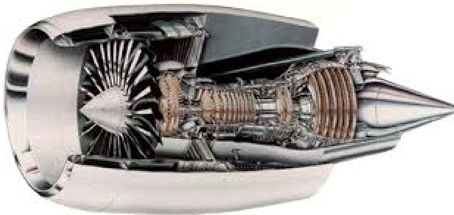
Figure 1. Titanium usage in the GE-90 aero-engine.

turbocharger vanes. The distinctive properties of titanium alloy (Ti-6Al-4V) such as low density (from an economical point of view, a lower mass implies lower fuel consumption), its excellent combination of high specific strength ratio that is maintained at an elevated temperature, low modulus of elasticity, and corrosion resistance justify its applications in aerospace, automotive, and marine industries [3, 4]. For example, higher operating temperatures of cars and turbine engines allow more efficient energy (fuel) conversion with lower toxic emissions [5]. In addition, titanium also has a high melting point, 1678 °C, indicating that it shows good creep resistance over different range of temperatures [6, 7]. However, with the distinctive advantages, voiding catastrophic breakdown in application of titanium in higher service temperature and friction in aerospace and automobile industries justifies the need for surface engineering techniques for improving performance of engineering components, longer component life, and failure prevention. In this chapter, adequate knowledge about laser surface cladding (LSC), a type of laser surface modification, and its processing parameters coupled with the oxidation, wear and corrosion performances of laser-modified titanium will be discussed.