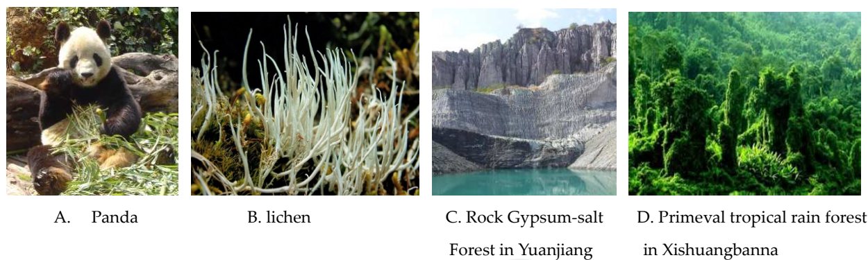
Figure 1. Sources of a part of test samples.

In general, the isolation of actinomycetes has three targets. First is the study on the community of actinomycetes in a special environment. In this condition, all of actinomycetes as the pure cultures should be isolated and identified. In order to manage to this target, the isolation media used should be propitious to the growth of possible more actinomycetes, and other microbes do not grow. Three to five media with different components should be used. Inhibitors against Gram-negative bacteria and fungi should be added into the media.