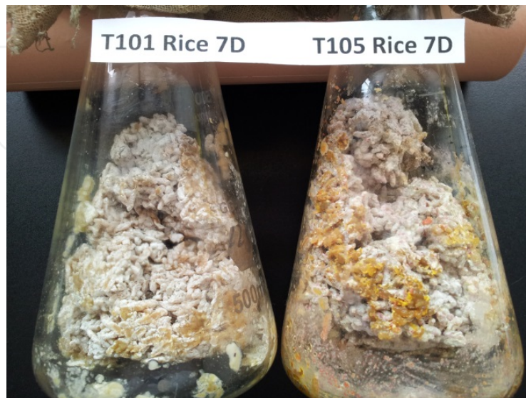
Figure 3. Solid fermentation of two streptomycete strains in rice+YIM 61 broth for 7 days at 28°C.

fermentation. The optimum component of solid medium for different actinomycetes is different from each other. It has to emphasize that not all of actinomycetes can grow in solid fermentation.